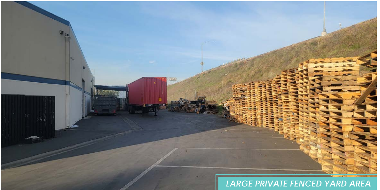
LARGE PRIVATE FENCED YARD AREA