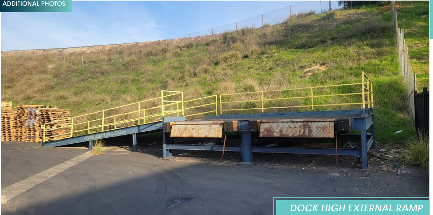
DOCK HIGH EXTERNAL RAMP