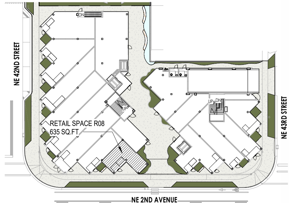
1 KEY PLAN SCALE: 1" = 50'-0"