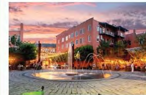
IRONWORKS SONO Year Built: 2014 Type: Multifamily Units / Keys: 109