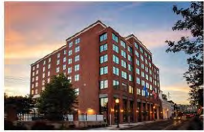
RESIDENCES INN BY MARRIOTT Year Built: 2019 Type: Hotel Units / Keys: 102