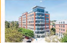
THE MARITIME Year Built: 2007 Type: Multifamily Units / Keys: 61