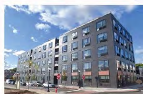
SONO 19 DAY Year Built: 2017 Type: Multifamily Units / Keys: 58