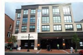
SONO PEARL APARTMENTS Year Built: 2016 Type: Multifamily Units / Keys: 66