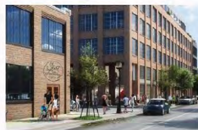
SHIRT FACTORY LOFTS Year Built: 2021 Type: Multifamily Units / Keys: 122