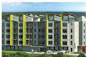
SONO ONE Year Built: 2020 Type: Multifamily Units / Keys: 40