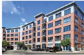
THE SHEFFIELD SONO Year Built: 2007 Type: Multifamily Units / Keys: 136 SOLD FOR $53MM IN 2020