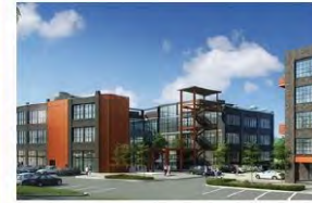
BRIM & CROWN Year Built: 2019 Type: Multifamily Units / Keys: 189