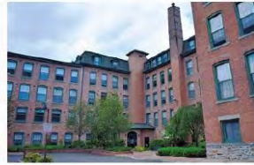
CORSET FACTORY Year Built: 1992 Type: Multifamily Units / Keys: 80