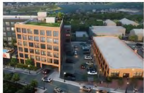
THE PLATFORM SONO Year Built: Under-Construction Type: Mixed-Use Units / Keys: 122