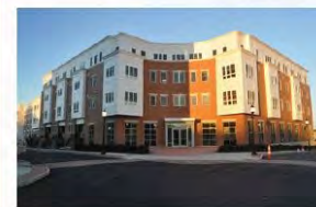
SOUNDVIEW LANDING Year Built: 2018 Type: Multifamily Units / Keys: 345