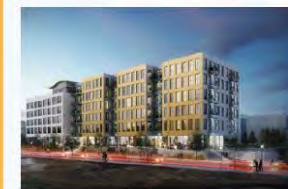
HARBOURSIDE SONO Year Built: 2020 Type: Multifamily Units / Keys: 129