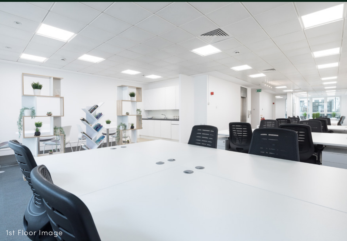
1st Floor Image