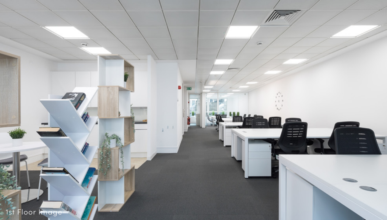
1st Floor Image