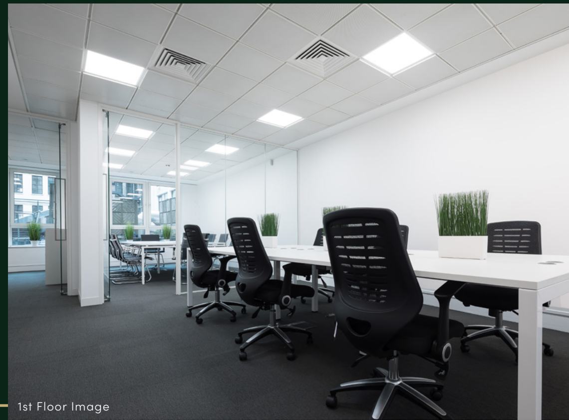
1st Floor Image