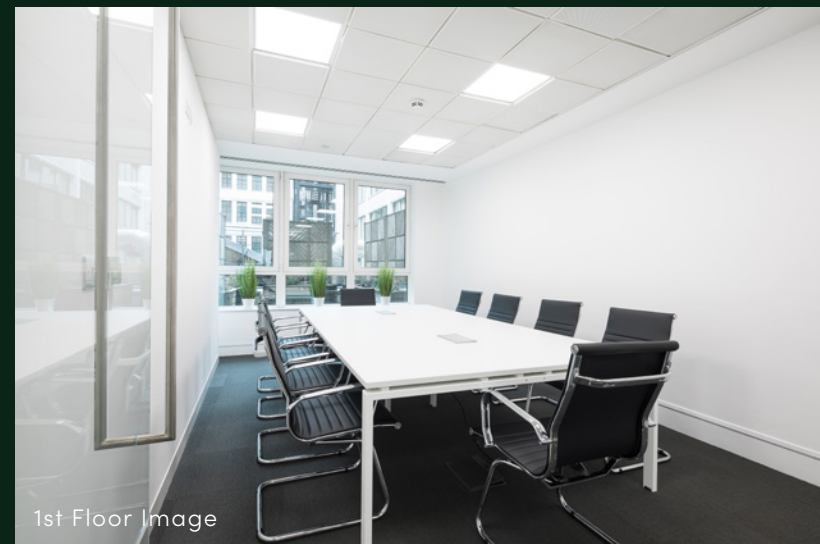
1st Floor Image