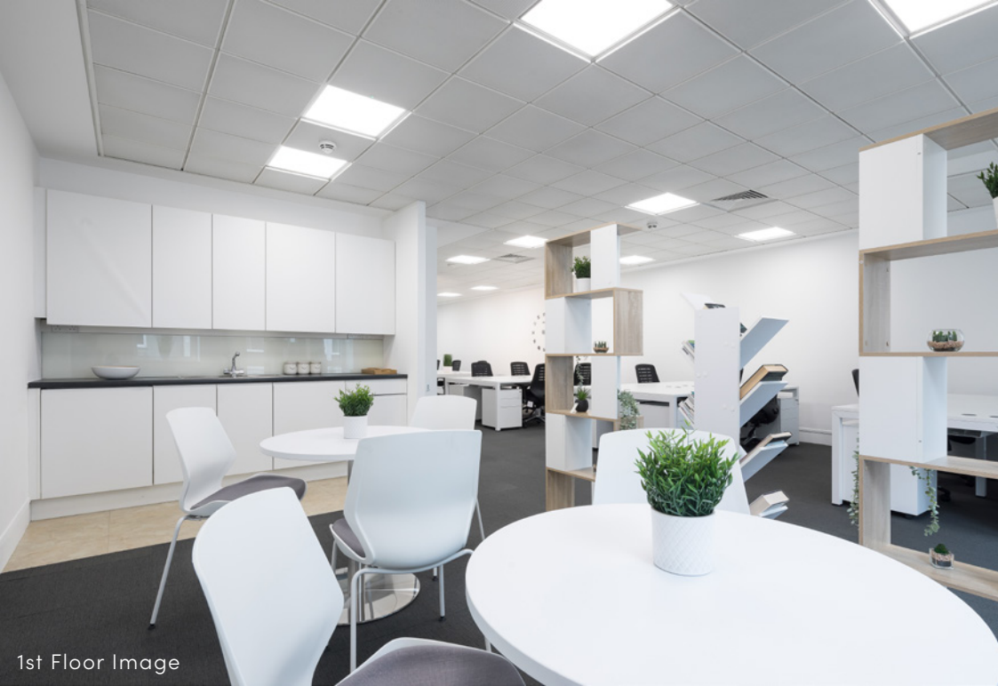
1st Floor Image