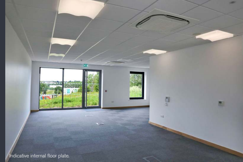
Indicative internal floor plate.

The building is self-contained with a private entrance providing allocated car parking immediately outside of the unit. Forming part of the University of Essex's 40-acre Knowledge Gateway, it benefits from University support and facilities and 24-hour security patrols.