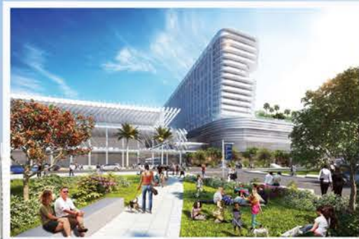
New 800-Room Grand Hyatt Late 2027