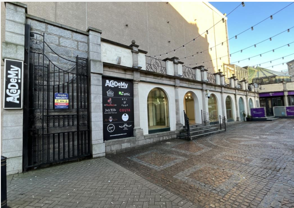
ENTRANCE TO LSU 1

Internally the unit is laid out to provide an open plan retail/leisure space with associated staff welfare facilities. The property benefits from large display windows along the south and west elevations.