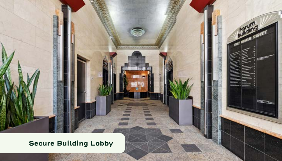
Secure Building Lobby