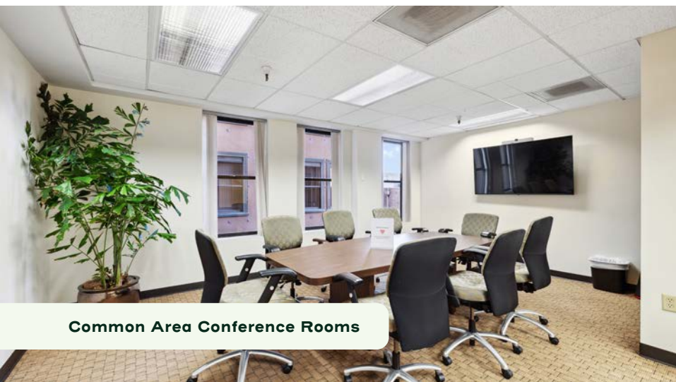
Common Area Conference Rooms