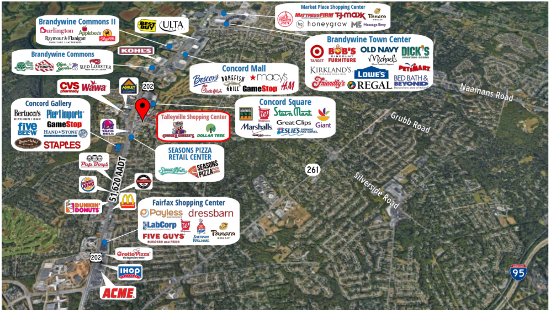
Great location surrounded by numerous national and local retailers!