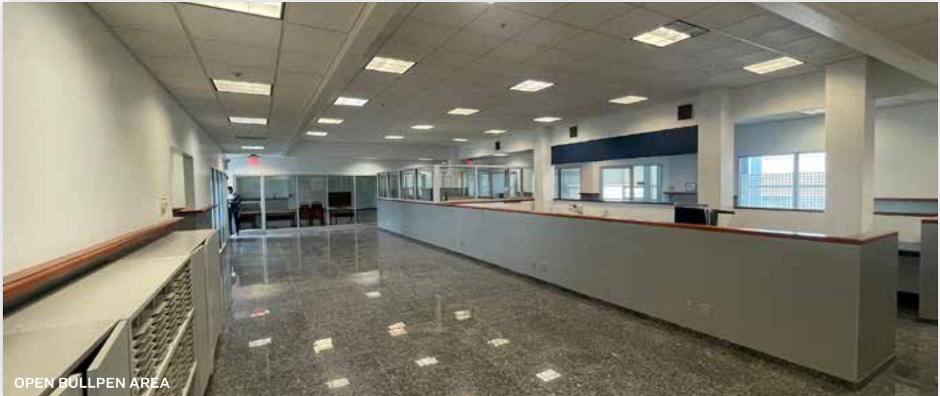
OPEN BULLPEN AREA