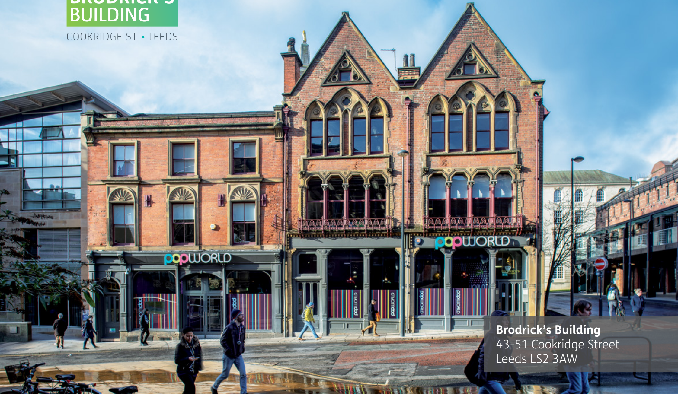
Brodrick's Building 43-51 Cookridge Street Leeds LS2 3AW