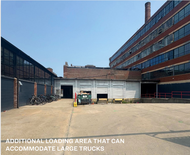
ADDITIONAL LOADING AREA THAT CAN ACCOMMODATE LARGE TRUCKS