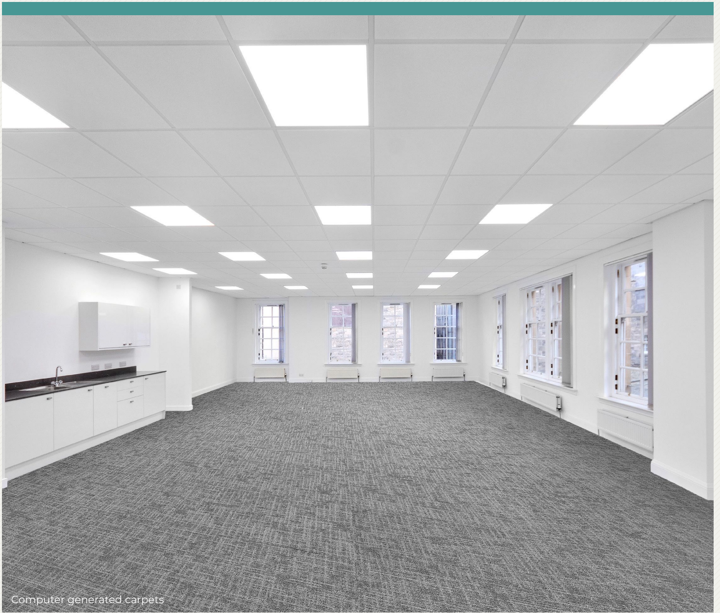
Computer generated carpets