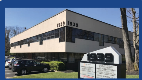
1939 Route 70