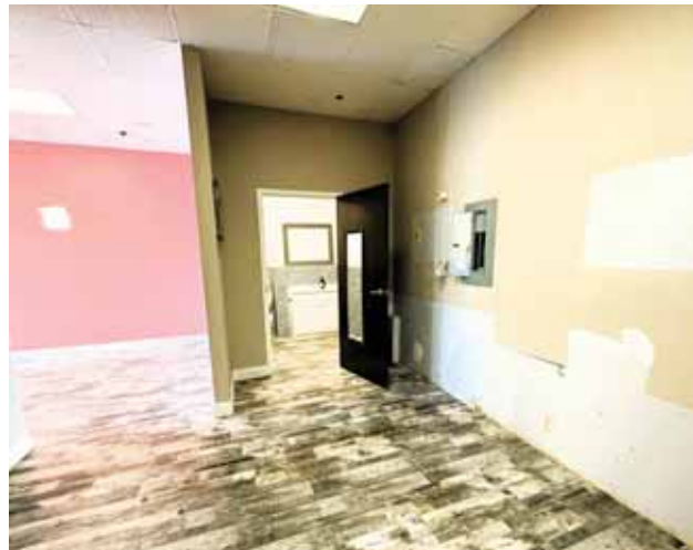
Interior - 40811 Fremont Blvd.