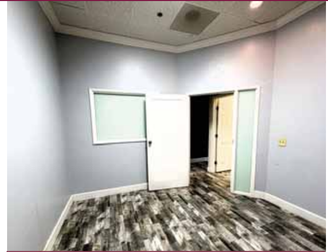
Interior - 40811 Fremont Blvd.