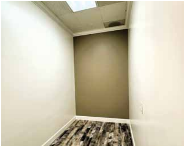
Interior - 40811 Fremont Blvd.