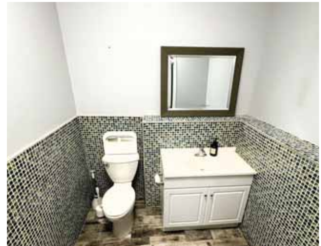
Interior - 40811 Fremont Blvd.