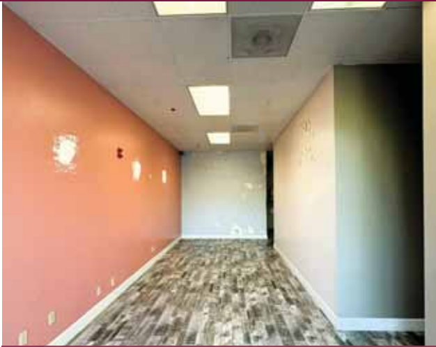
Interior - 40811 Fremont Blvd.