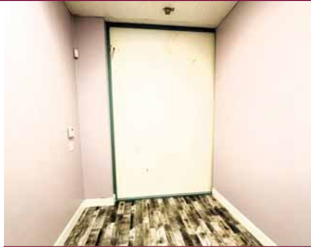
Interior - 40811 Fremont Blvd.