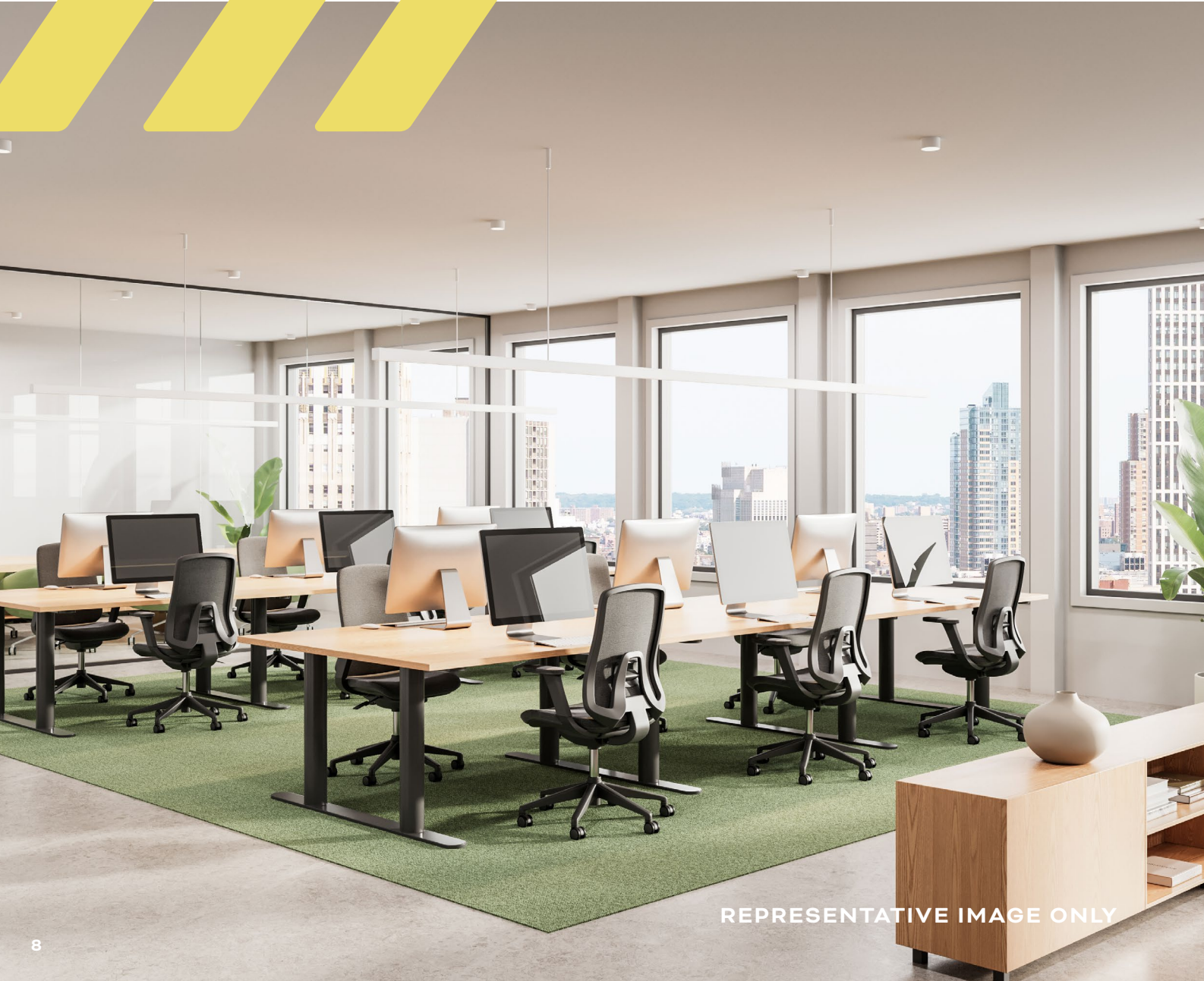
REPRESENTATIVE IMAGE ONLY