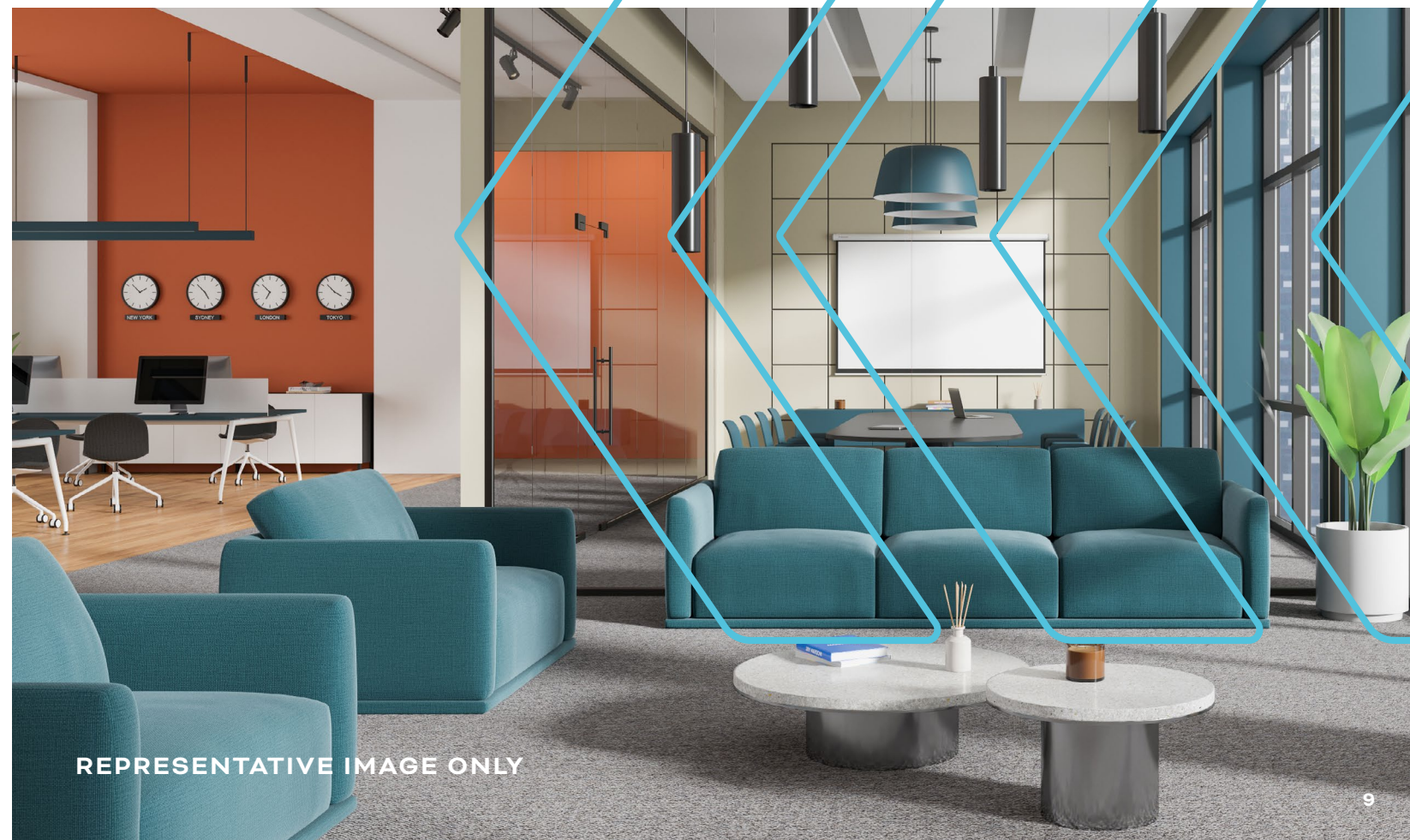
REPRESENTATIVE IMAGE ONLY