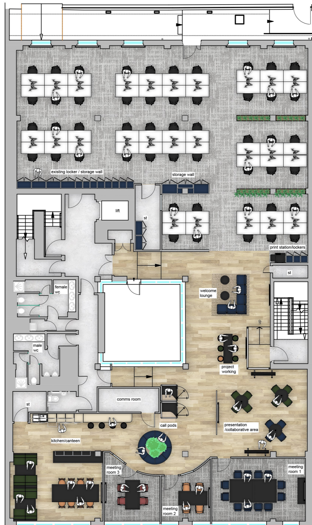
PROPOSED LOWER GROUND FLOOR LAYOUT - (1 : 150 @ A3)