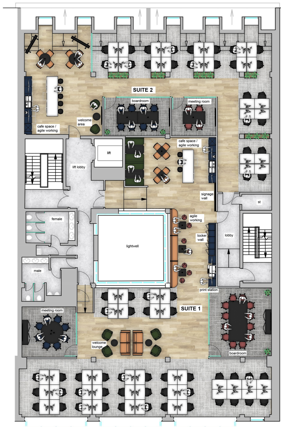
PROPOSED 2ND FLOOR LAYOUT - (1 : 150 @ A3) OPTION 3