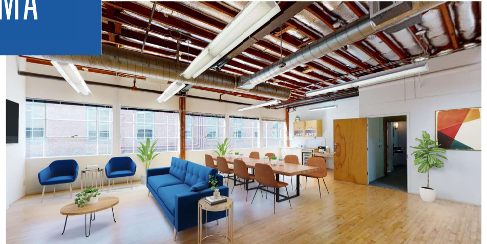
Open Space with High Ceilings