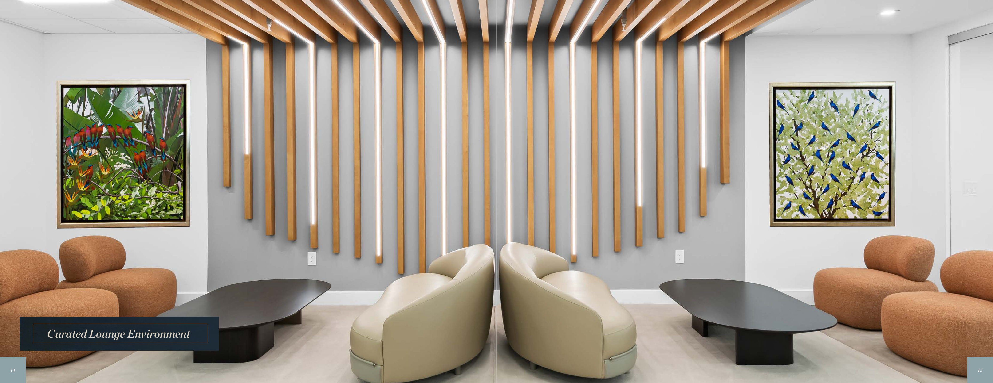
Curated Lounge Environment