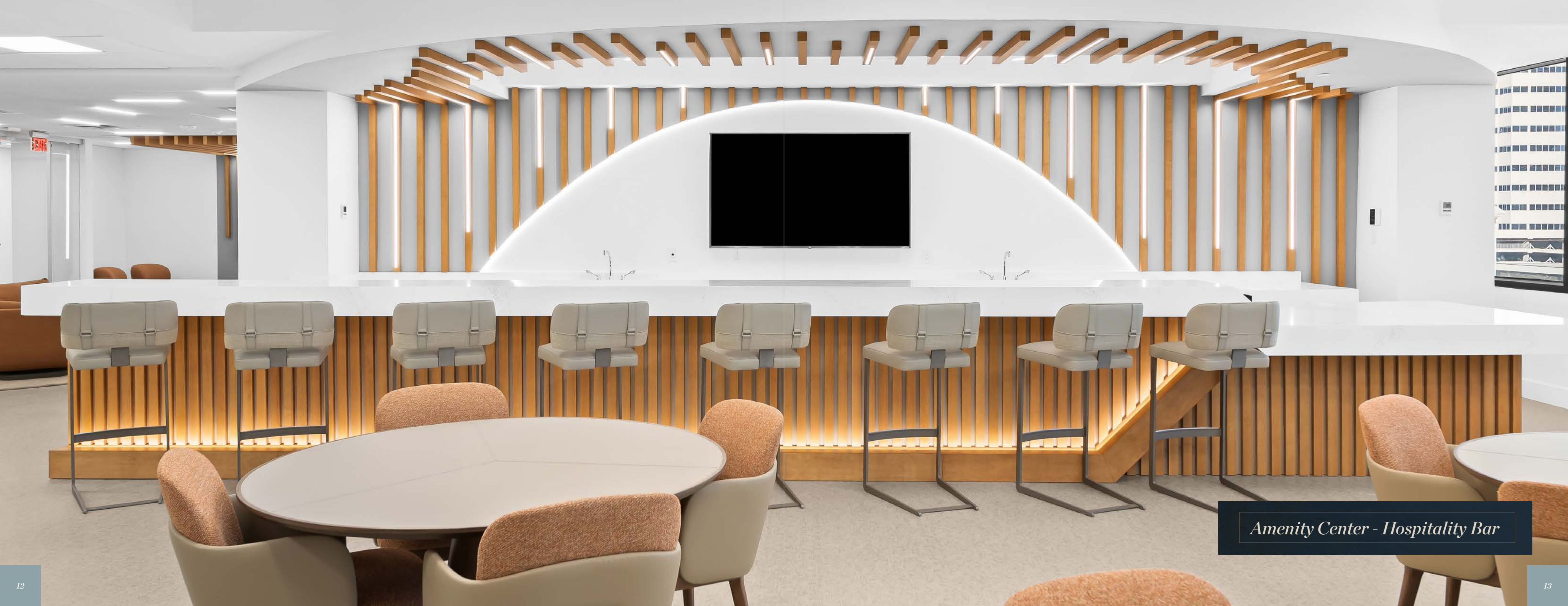
Amenity Center - Hospitality Bar