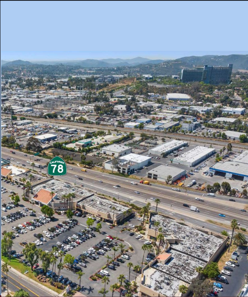
AERIAL VIEW — SR-78 CORRIDOR