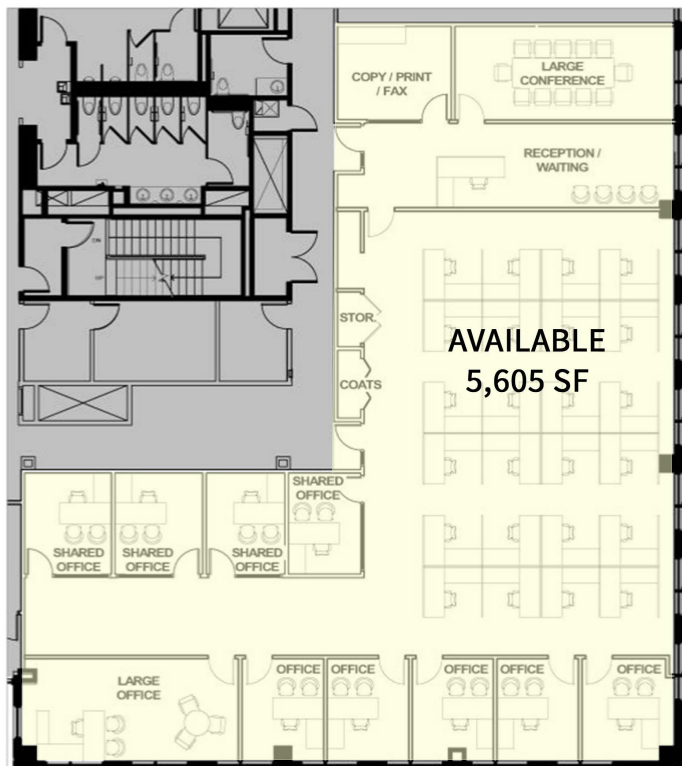
5th Floor 5,605 SF