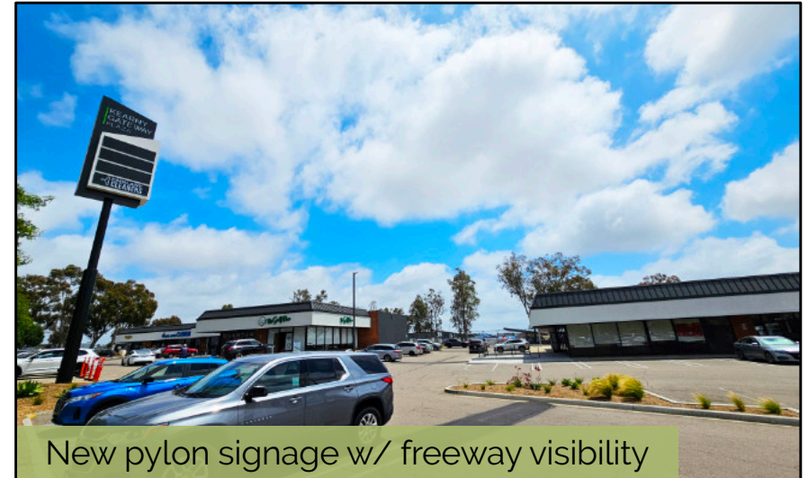
New pylon signage w/ freeway visibility