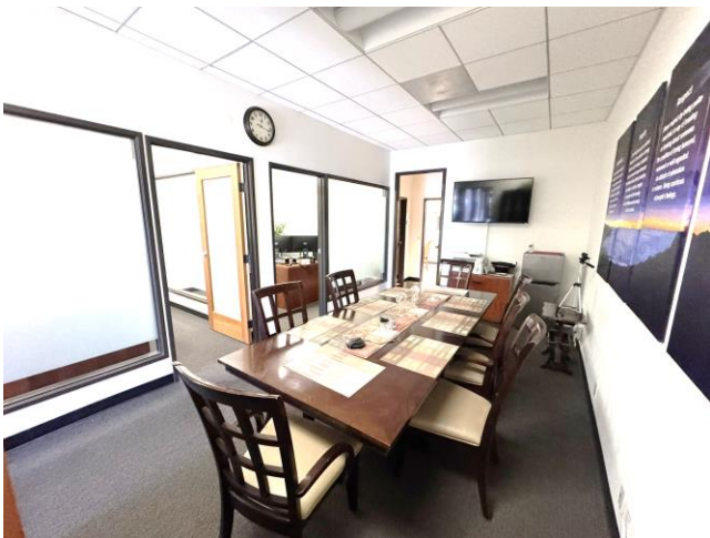
Private Conference Room