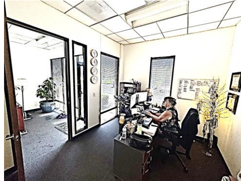
Offices / Reception