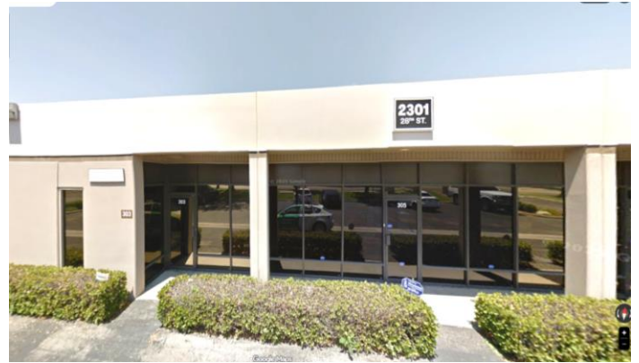
Link Business Park, Street Frontage Suite 303