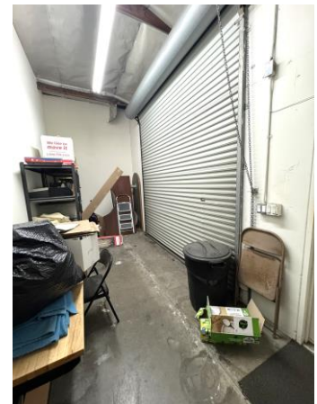
Storage / Flex-Warehouse with 14' Roll up Door