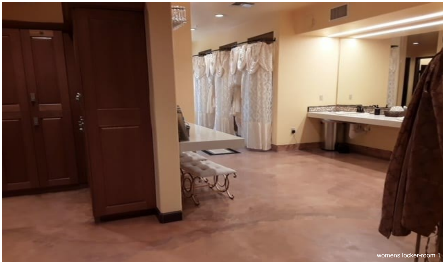
womens locker-room 1