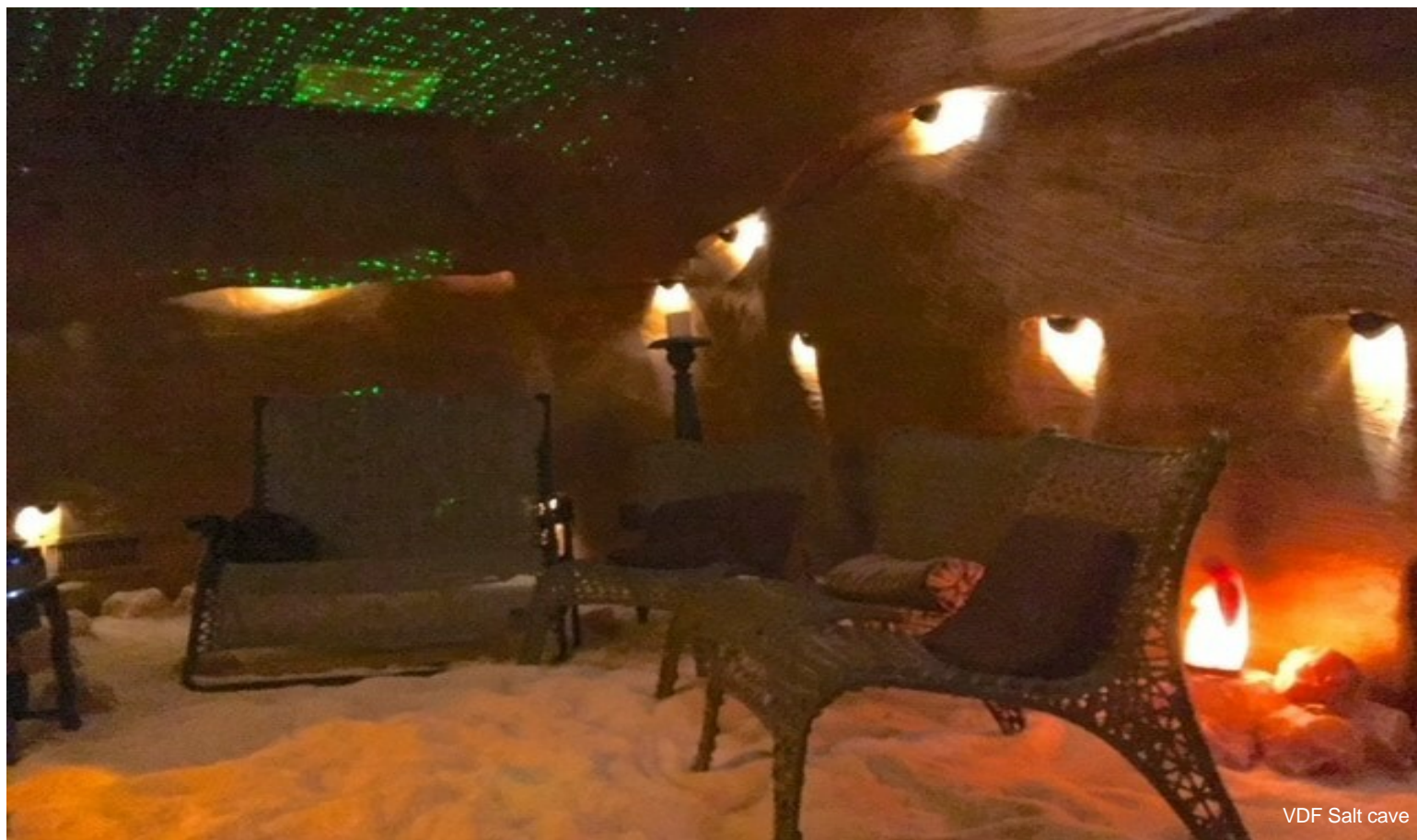
VDF Salt cave