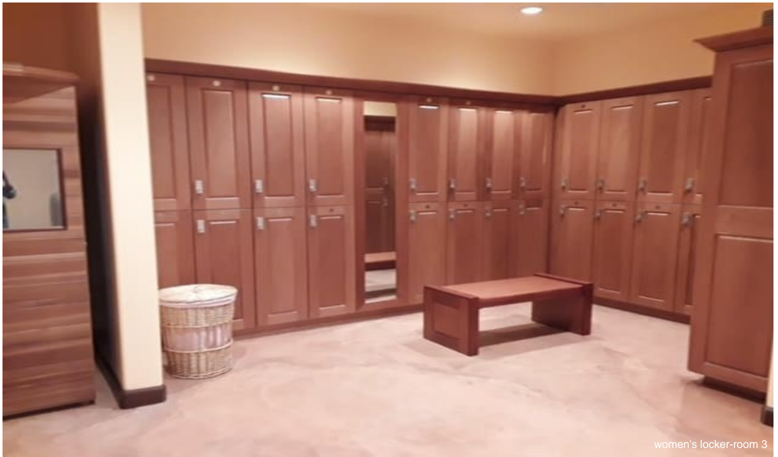
women's locker-room 3