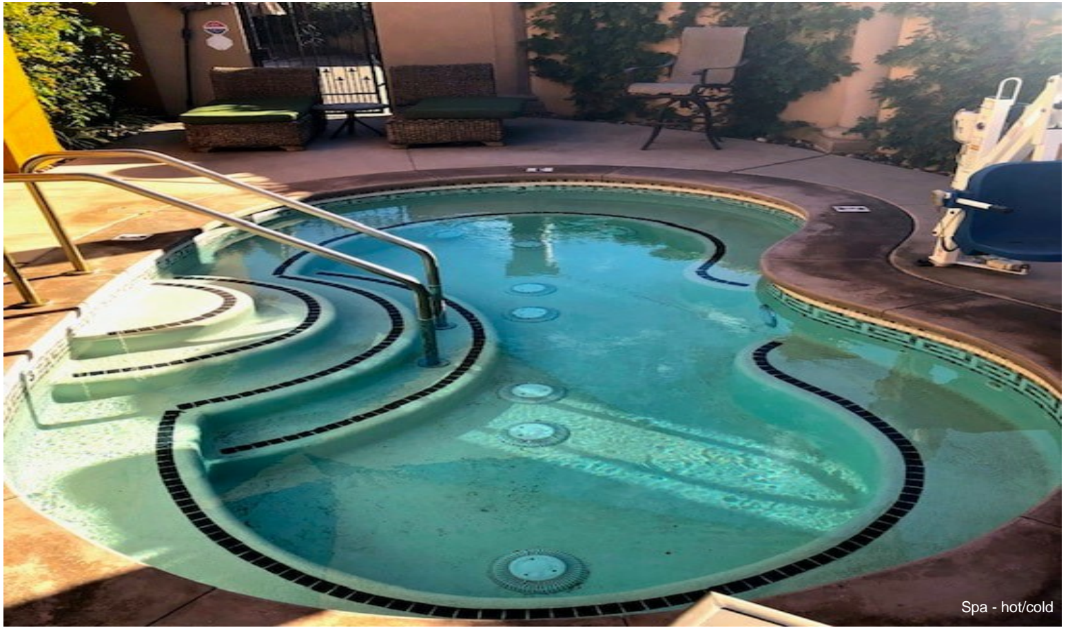
Spa - hot/cold