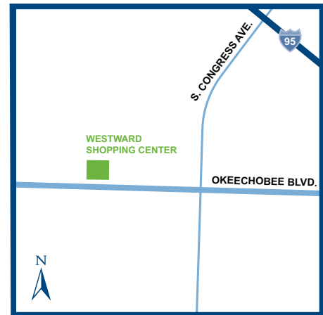
WESTWARD SHOPPING CENTER 2501 Okeechobee Boulevard West Palm Beach, FL 33409