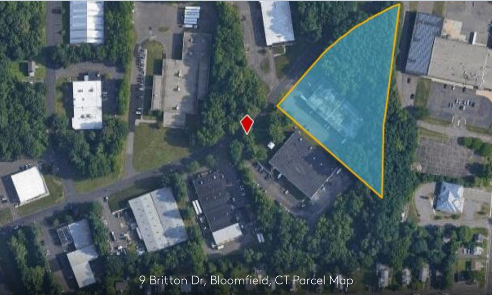
9 Britton Dr, Bloomfield, CT Parcel Map