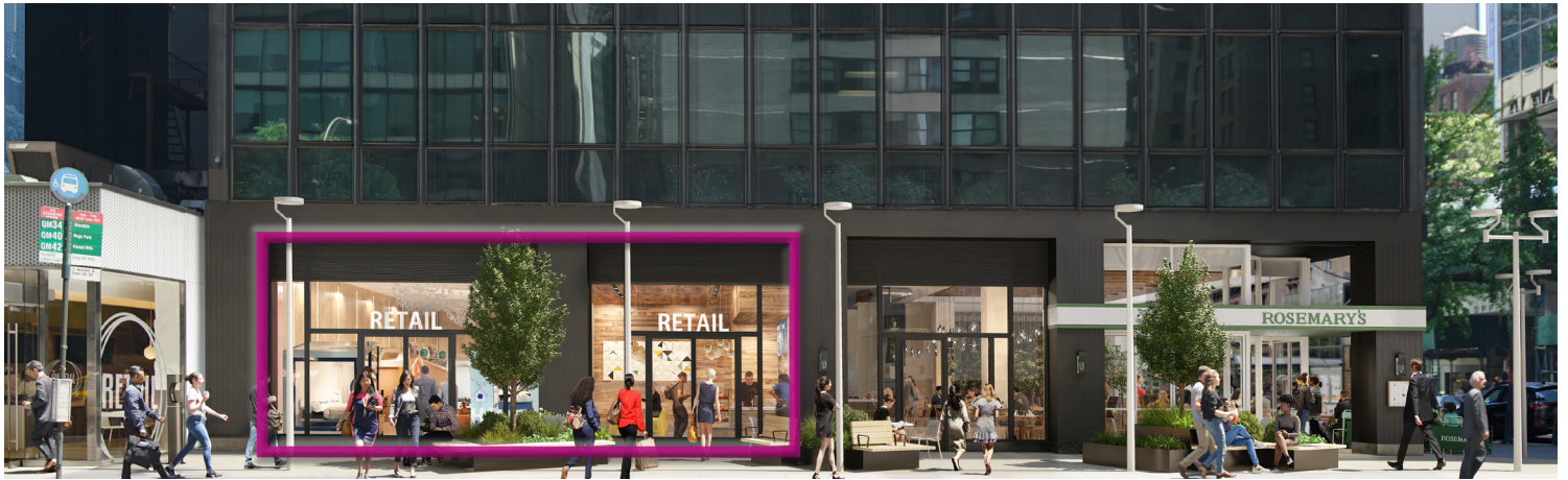
THIRD AVENUE RETAIL