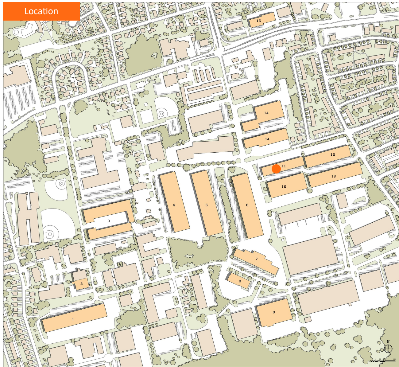
FOLCROFT WEST BUSINESS PARK