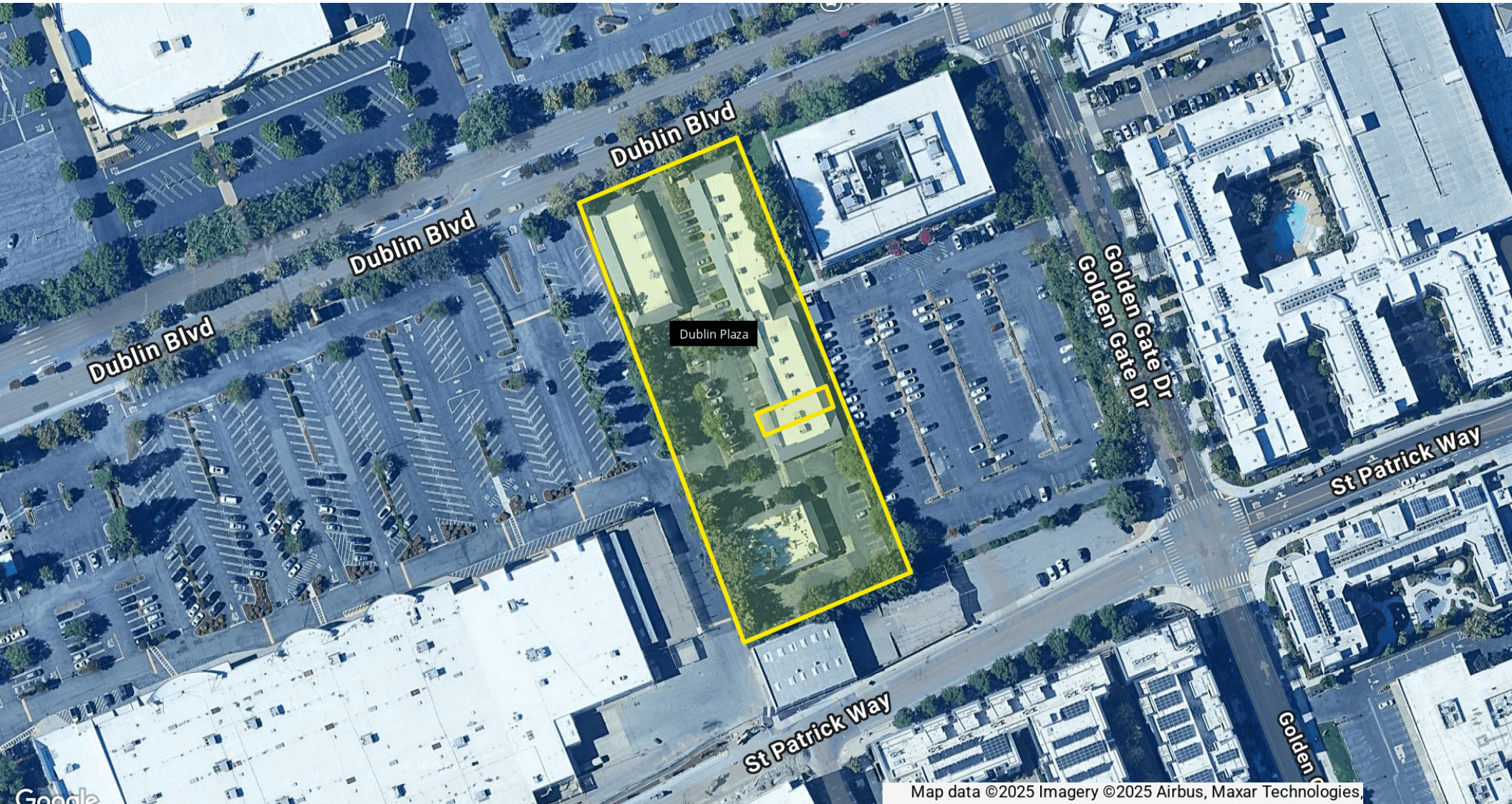
Map data ©2025 Imagery ©2025 Airbus, Maxar Technologies,

Tanner Laverty, CCIM 408.622.4490 x201 tanner@lavertychacon.com DRE Officer #01436559