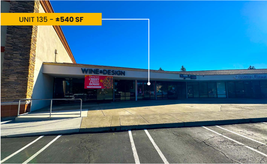
UNIT 135 - ±540 SF