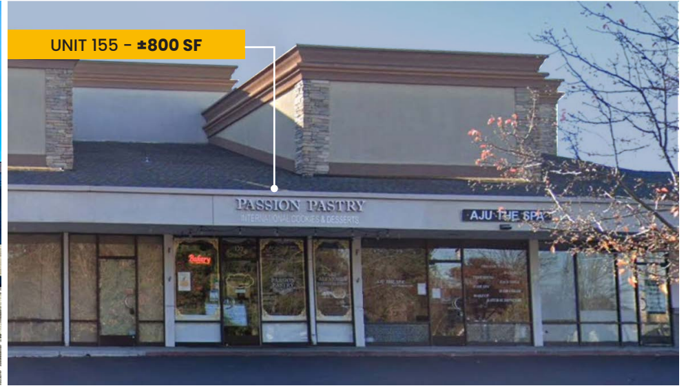
UNIT 155 - ±800 SF