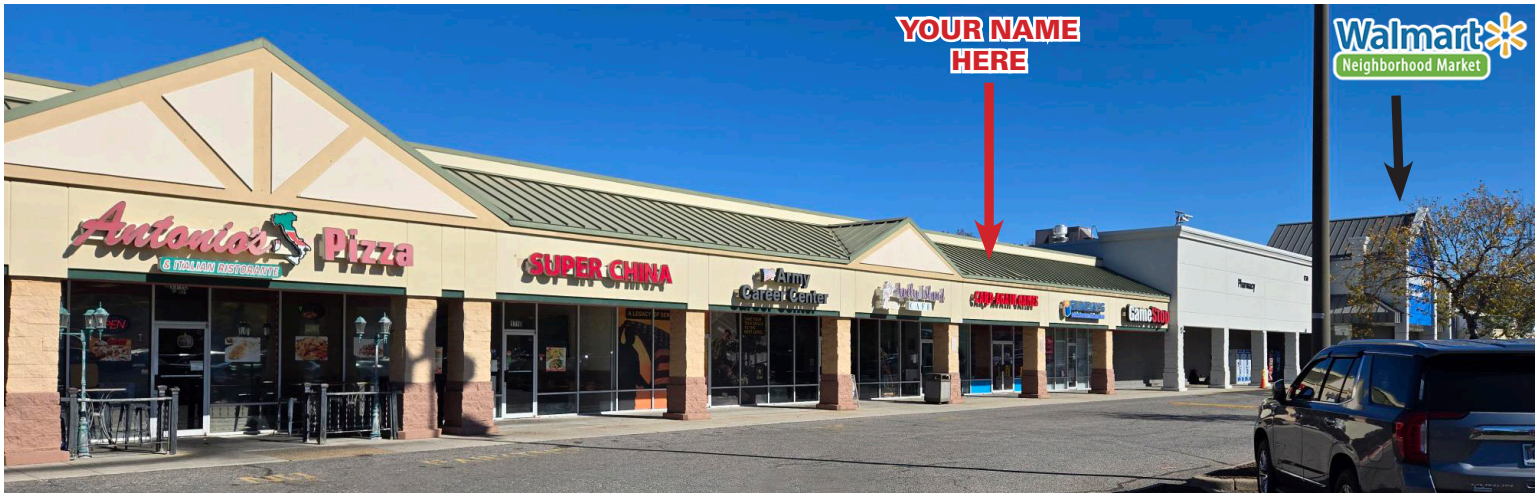
Small Shop Space

The information contained herein has been obtained from sources believed to be reliable but is not warranted. We cannot be responsible for errors, omissions, withdrawal, or prior lease. Broker has ownership interest in this property.