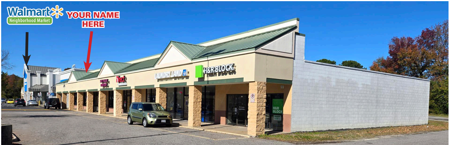
Small Shop Space