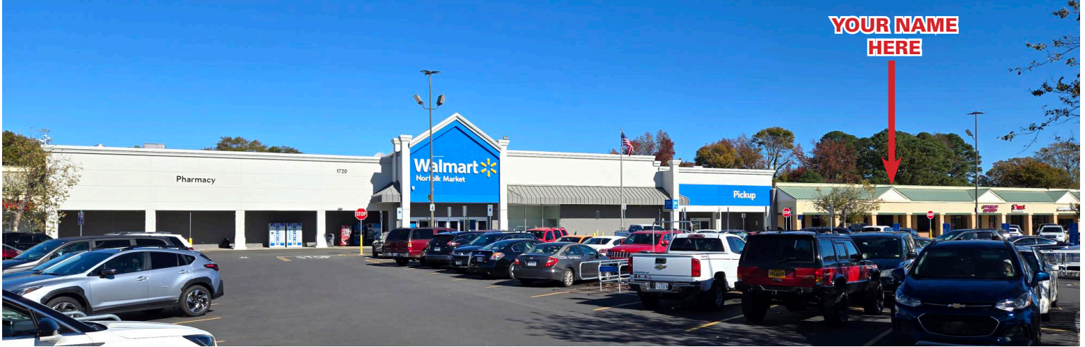
Walmart Neighborhood Market (recently renovated)