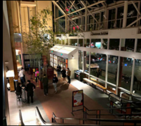
AMC KABUKI 8