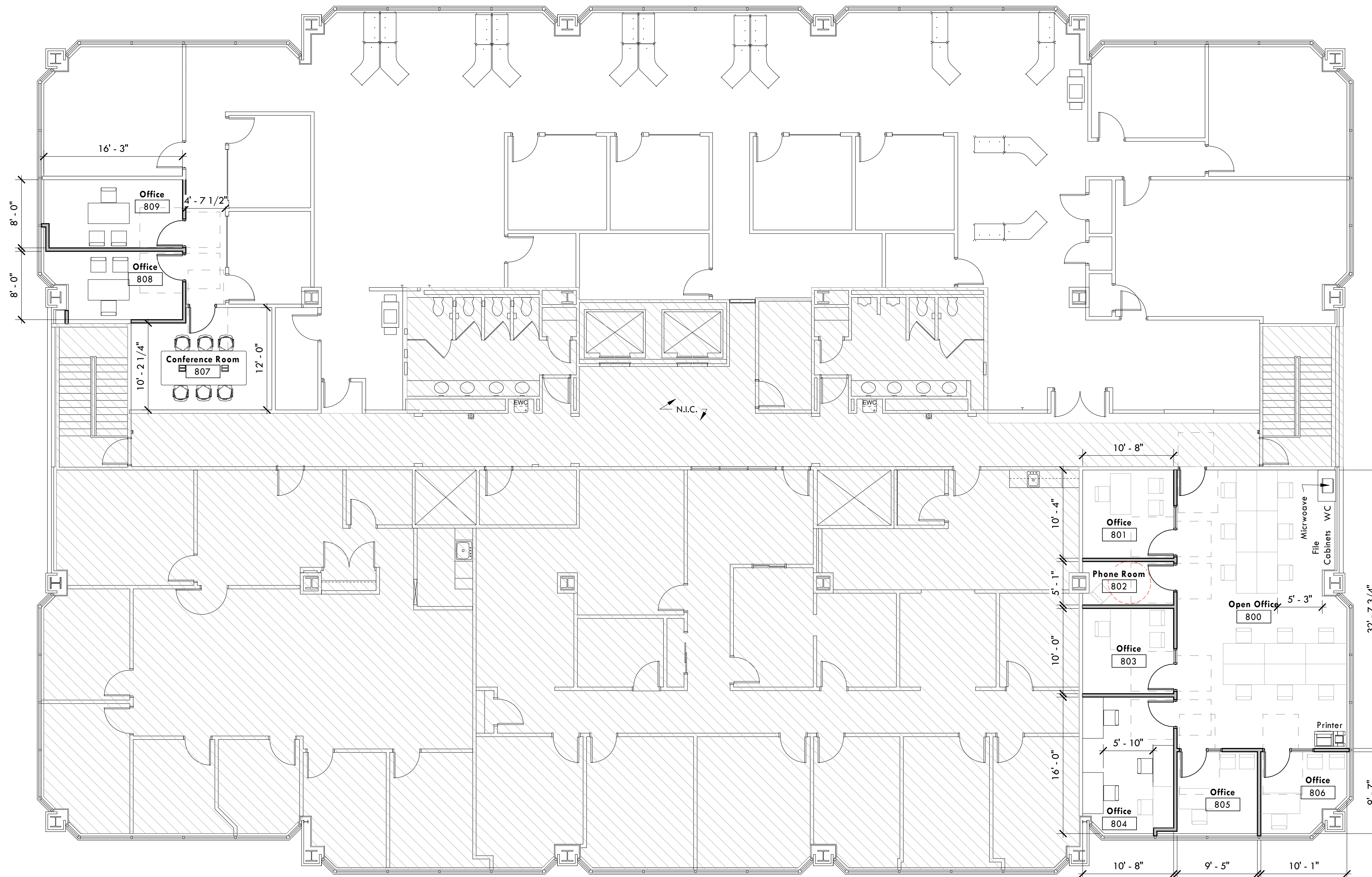
① 08 - Eighth Floor - Proposed Floor Plan 1/8" = 1'-0"

2790 Messide Boulevard Monroeville, PA 15146