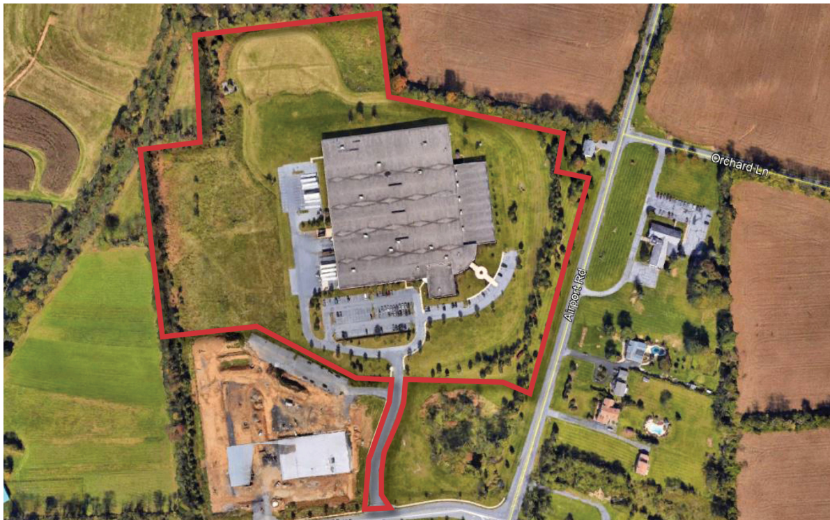
Entrance on Innovation Way with frontage on Airport Road