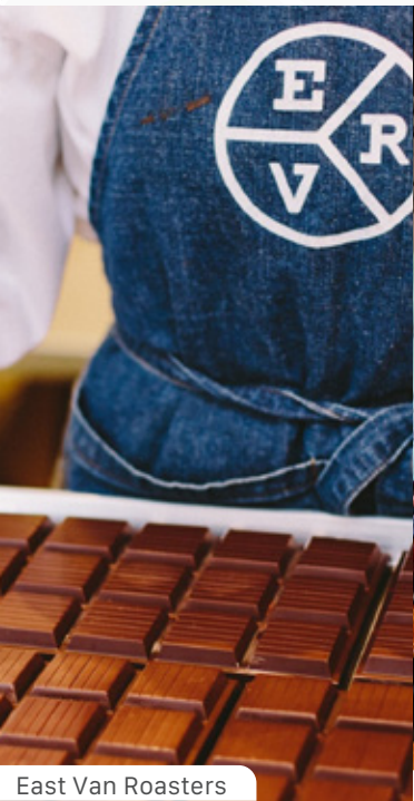
East Van Roasters