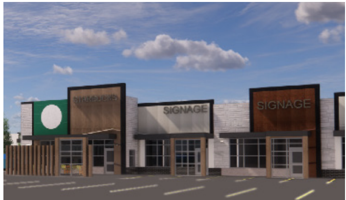
*Crossings building renderings are subject to change