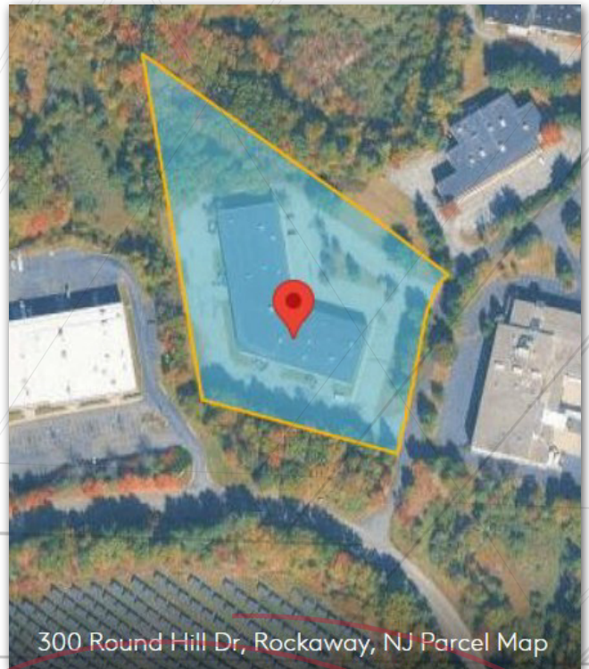
300 Round Hill Dr, Rockaway, NJ Parcel Map

Conveniently located directly off of Green Pond Road, at Exit 37, off Route 80. Bonus mezzanine warehouse storage!