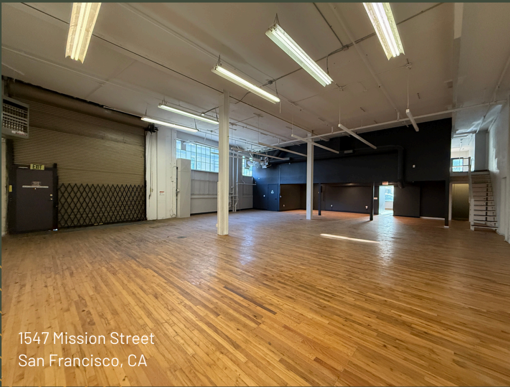
1547 Mission Street San Francisco, CA