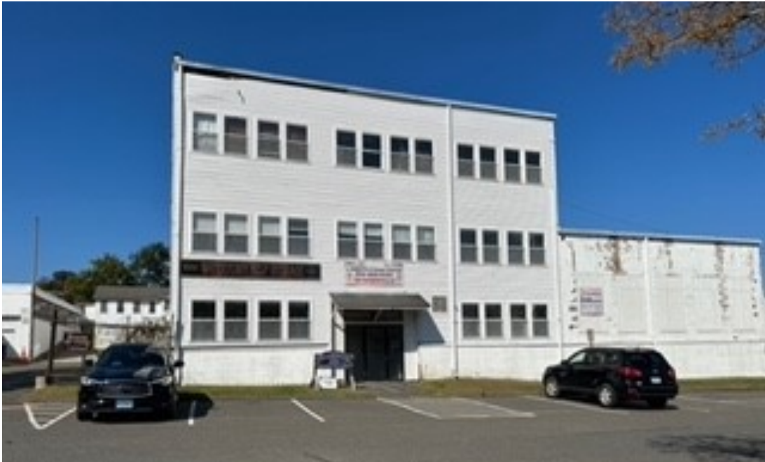
30 Echo Lake Road Watertown, CT 06795