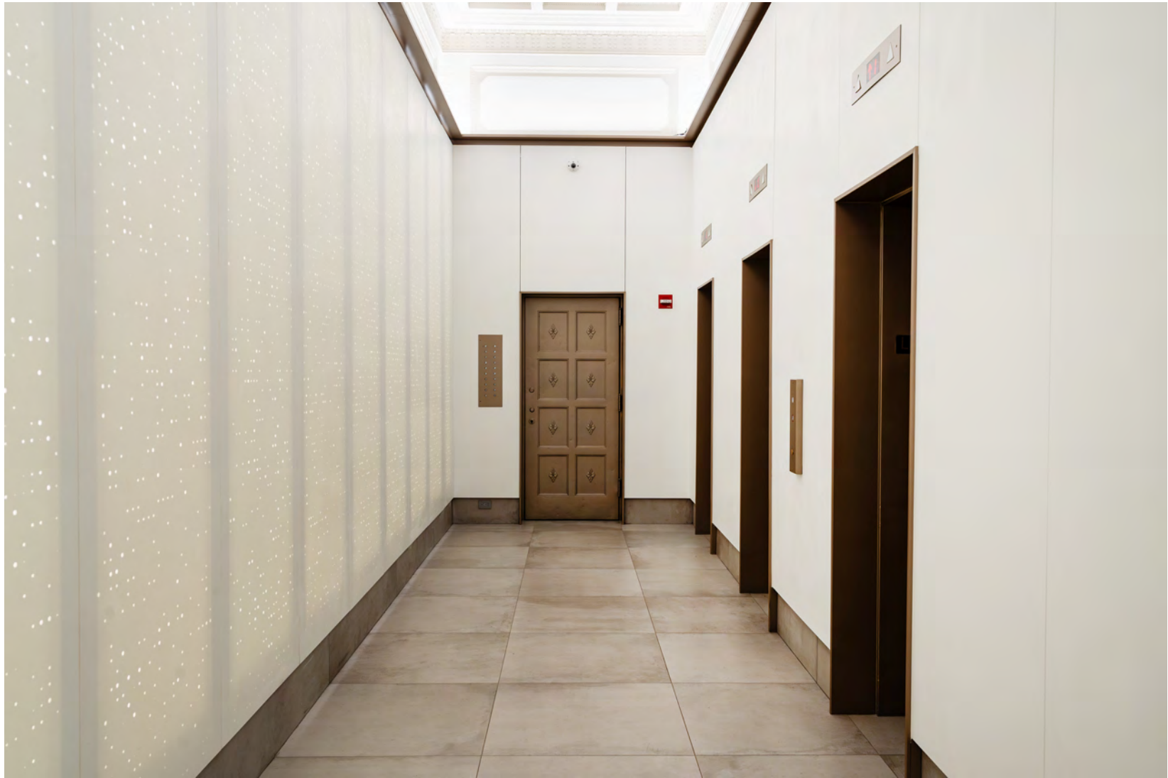
Brand new renovated lobby Upgraded elevators (3 passenger, 2 freight) 24/7 attended lobby