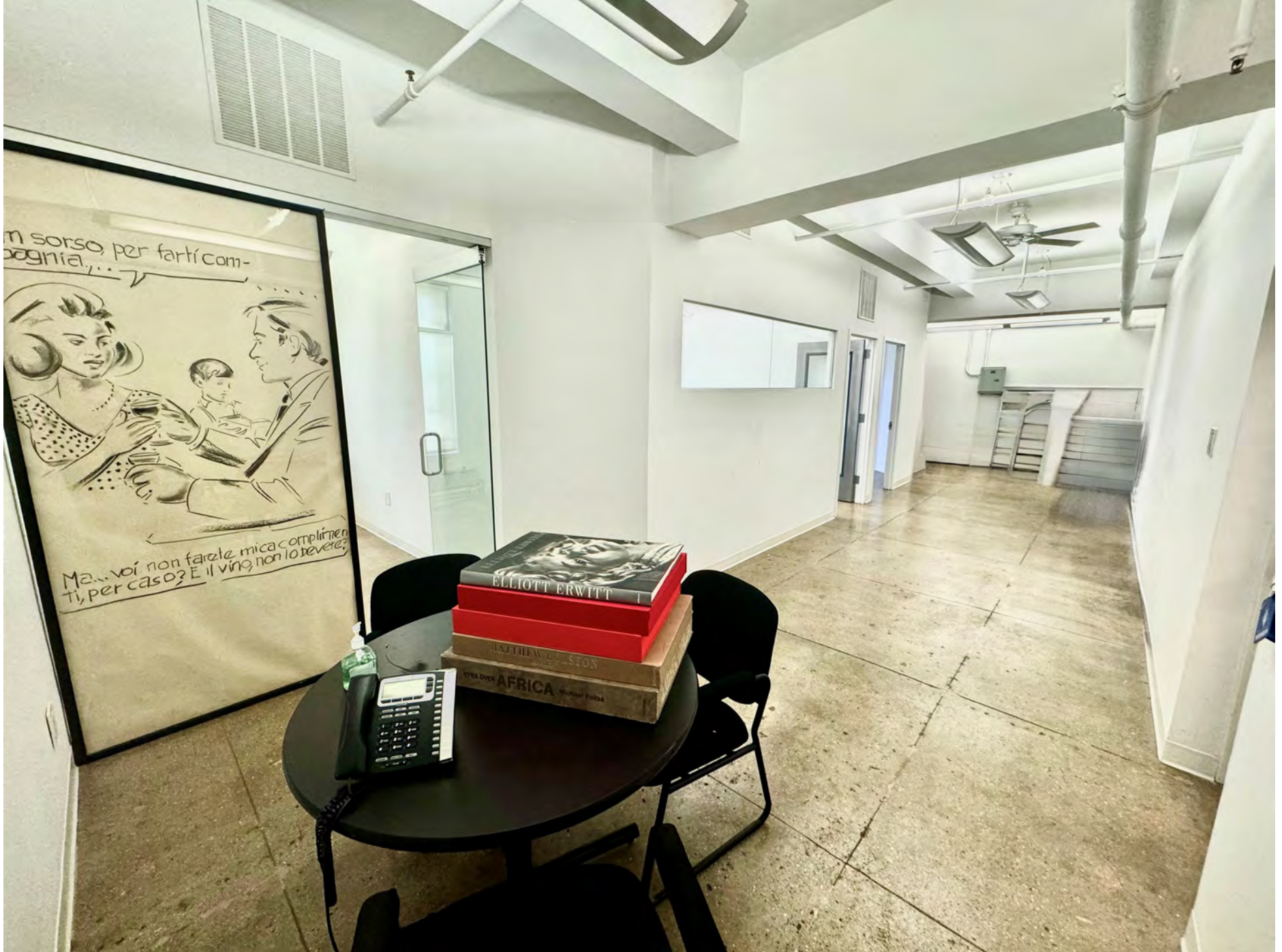
350 7th Avenue, Suite 1702 1,550 rentable sq. ft.