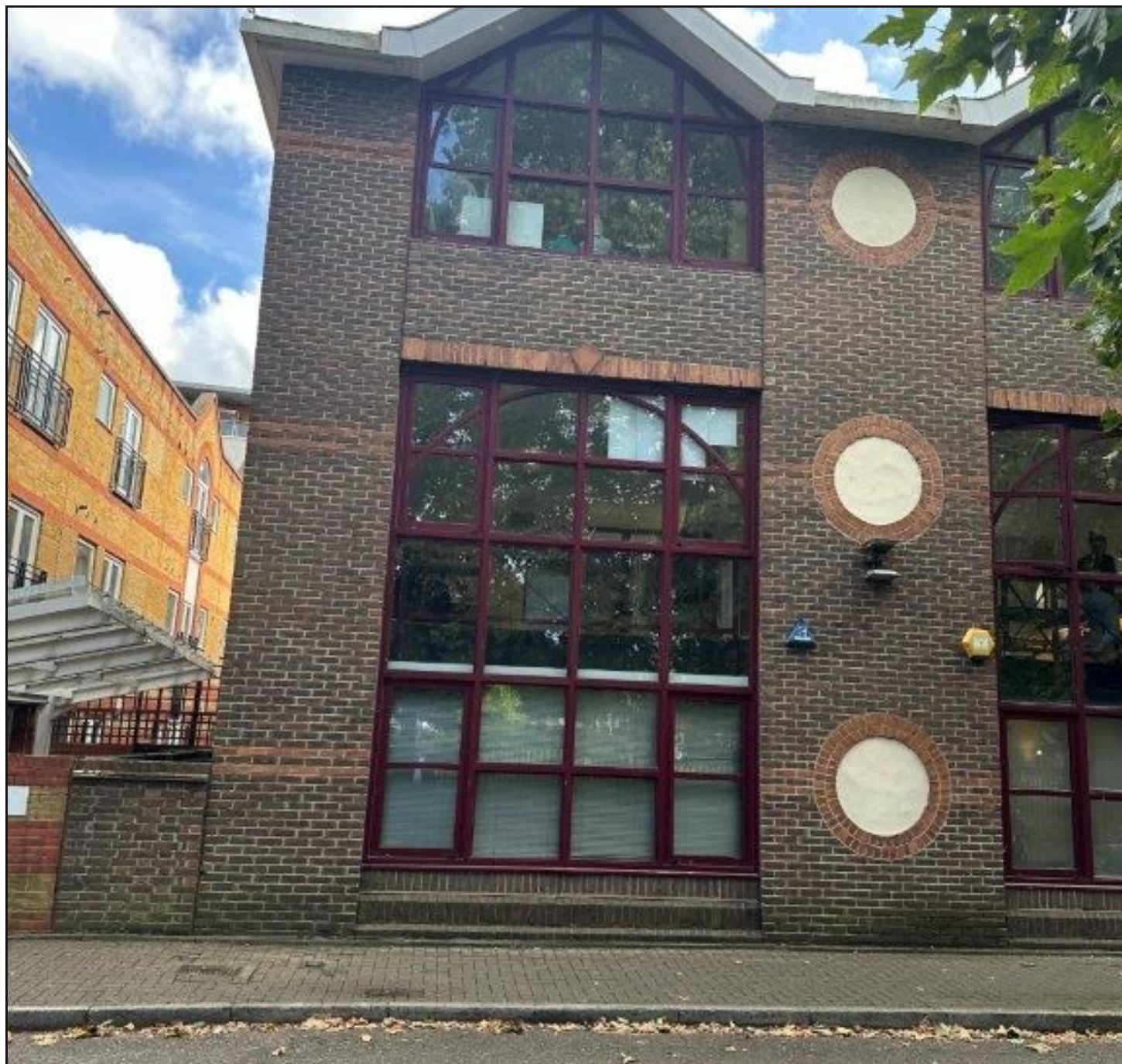
EXTERIOR OF UNIT 6

For further information or to arrange an inspection please contact sole agents: