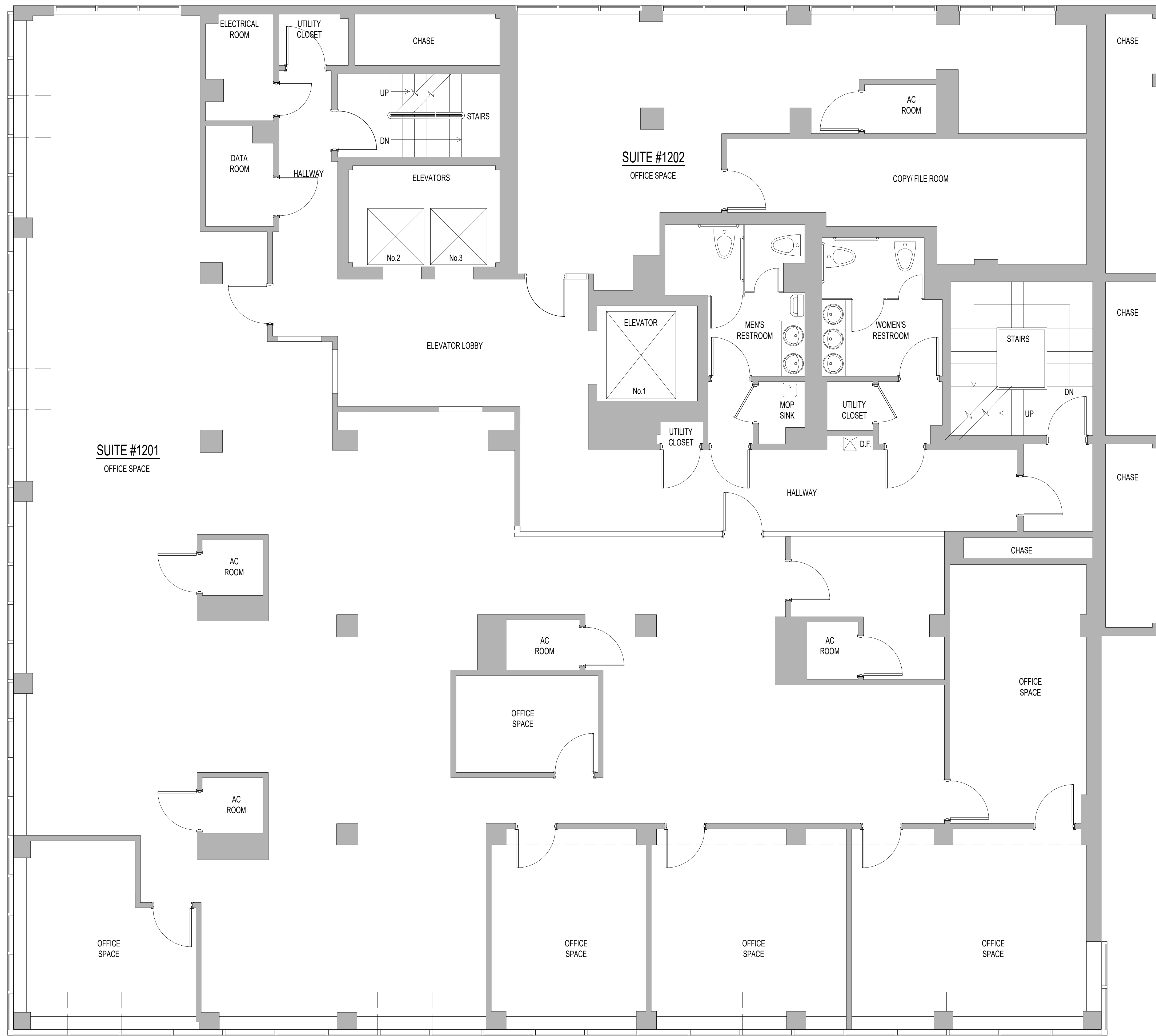
EXISTING FLOOR PLAN - 12 TH FLOOR SCALE 1/4" = 1'-0"