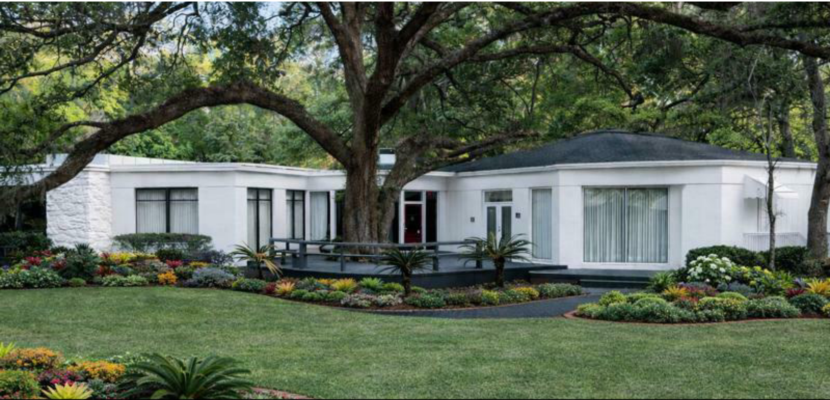
Disclaimer: This image has been digitally enhanced to illustrate planned improvements.