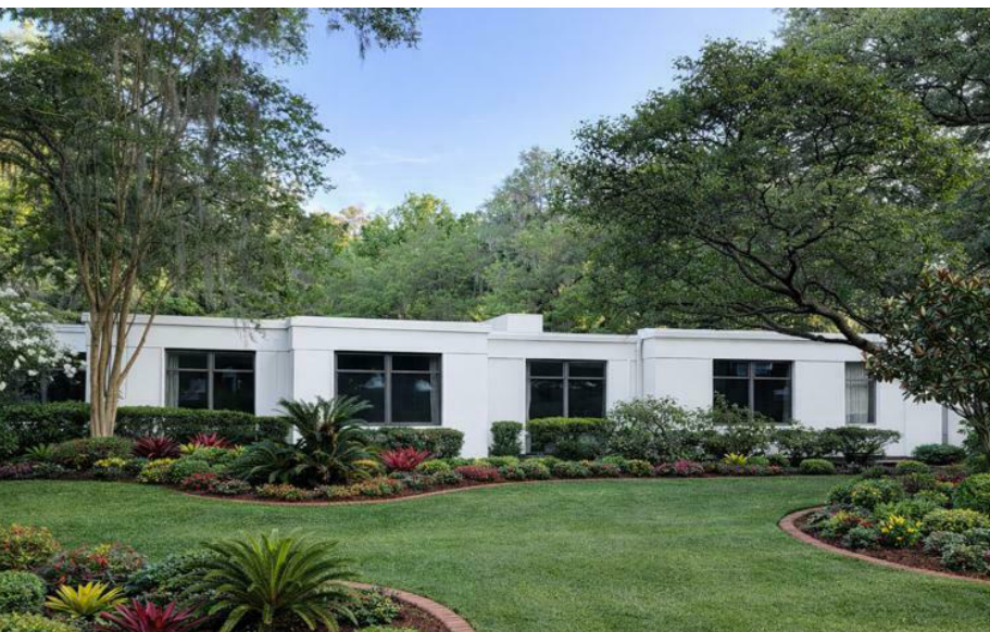
Disclaimer: This image has been digitally enhanced to illustrate planned improvements.