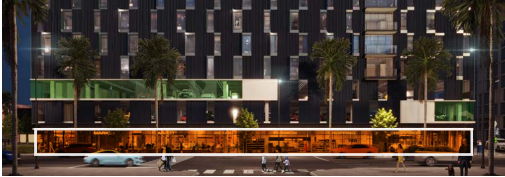
6007 Sunset Blvd - Ground Floor Retail