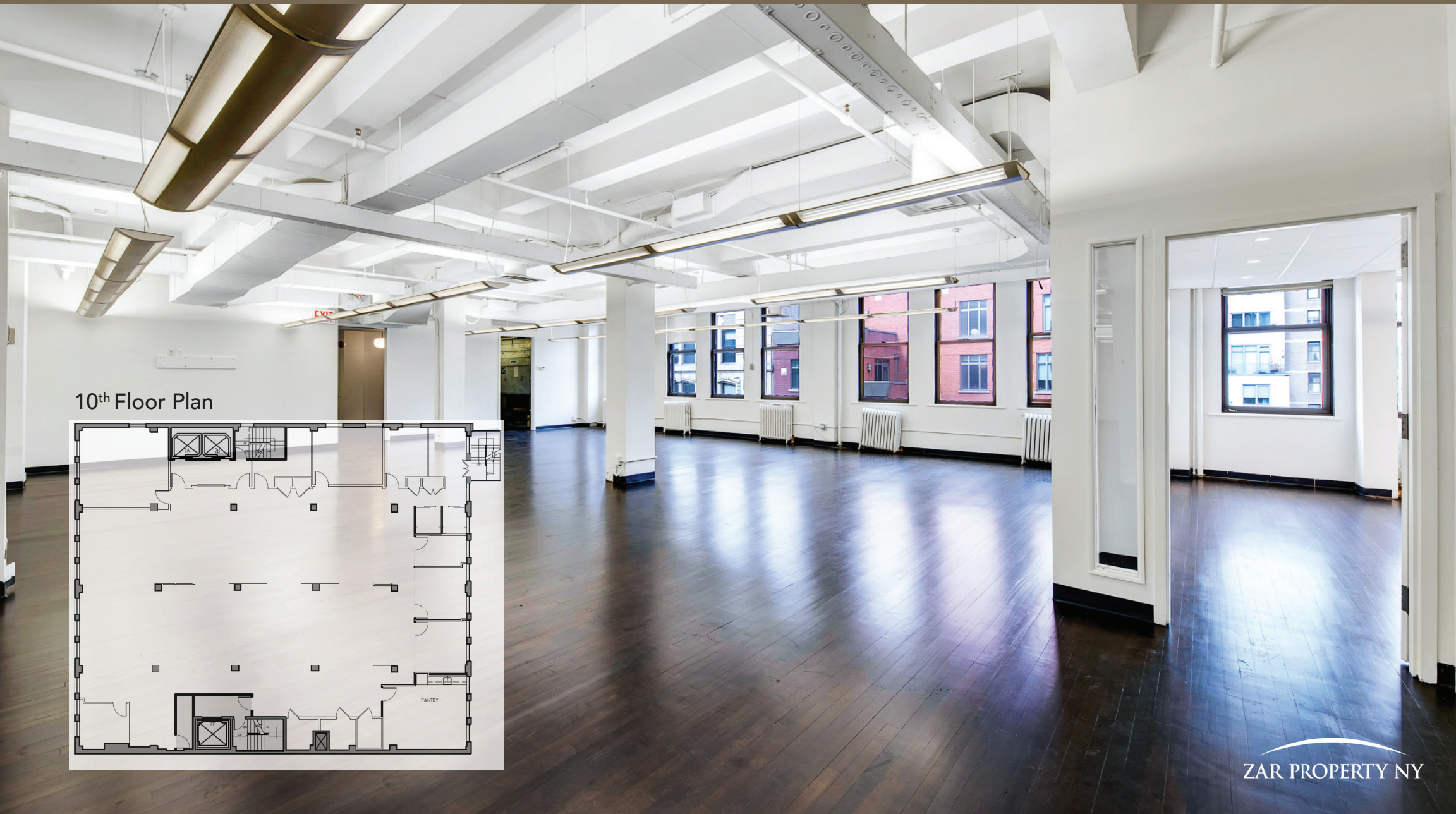
10 th Floor Plan