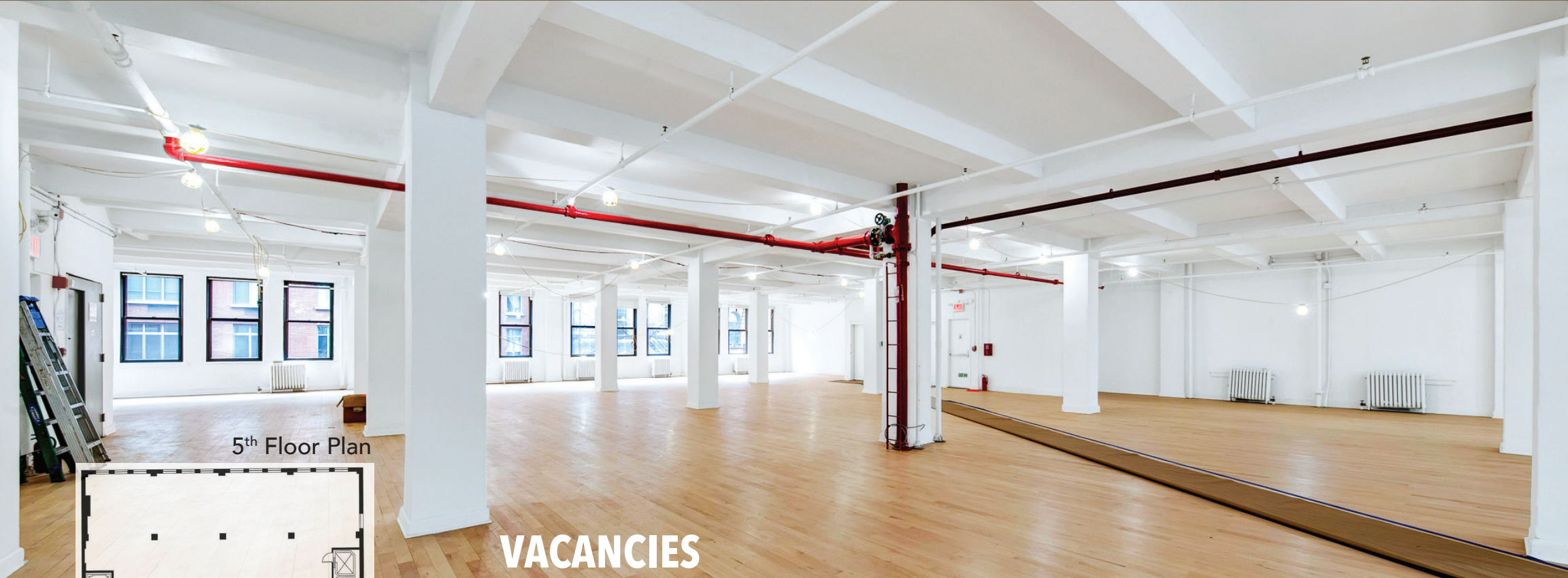
5 th Floor Plan