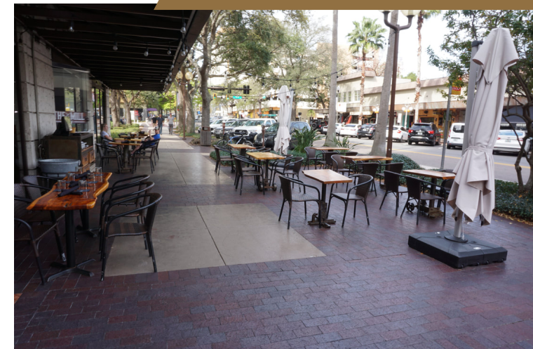
OUTSIDE DINING AREA