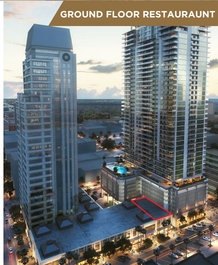
GROUND FLOOR RESTAURANT