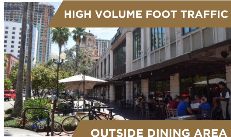
HIGH VOLUME FOOT TRAFFIC