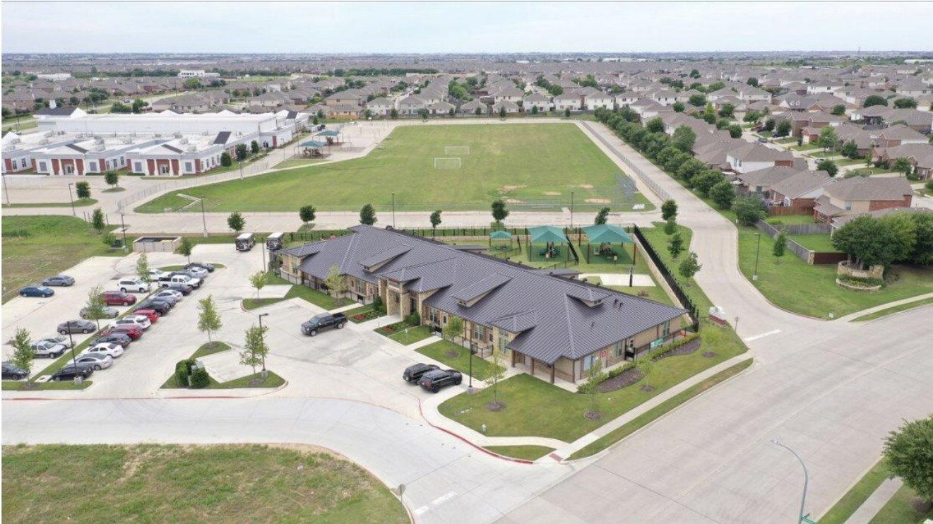
Aerial view — fenced playground, dedicated parking, direct Tehama Ridge Parkway frontage; surrounded by established single-family residential and adjacent to Champions International Leadership of Texas (K-8).