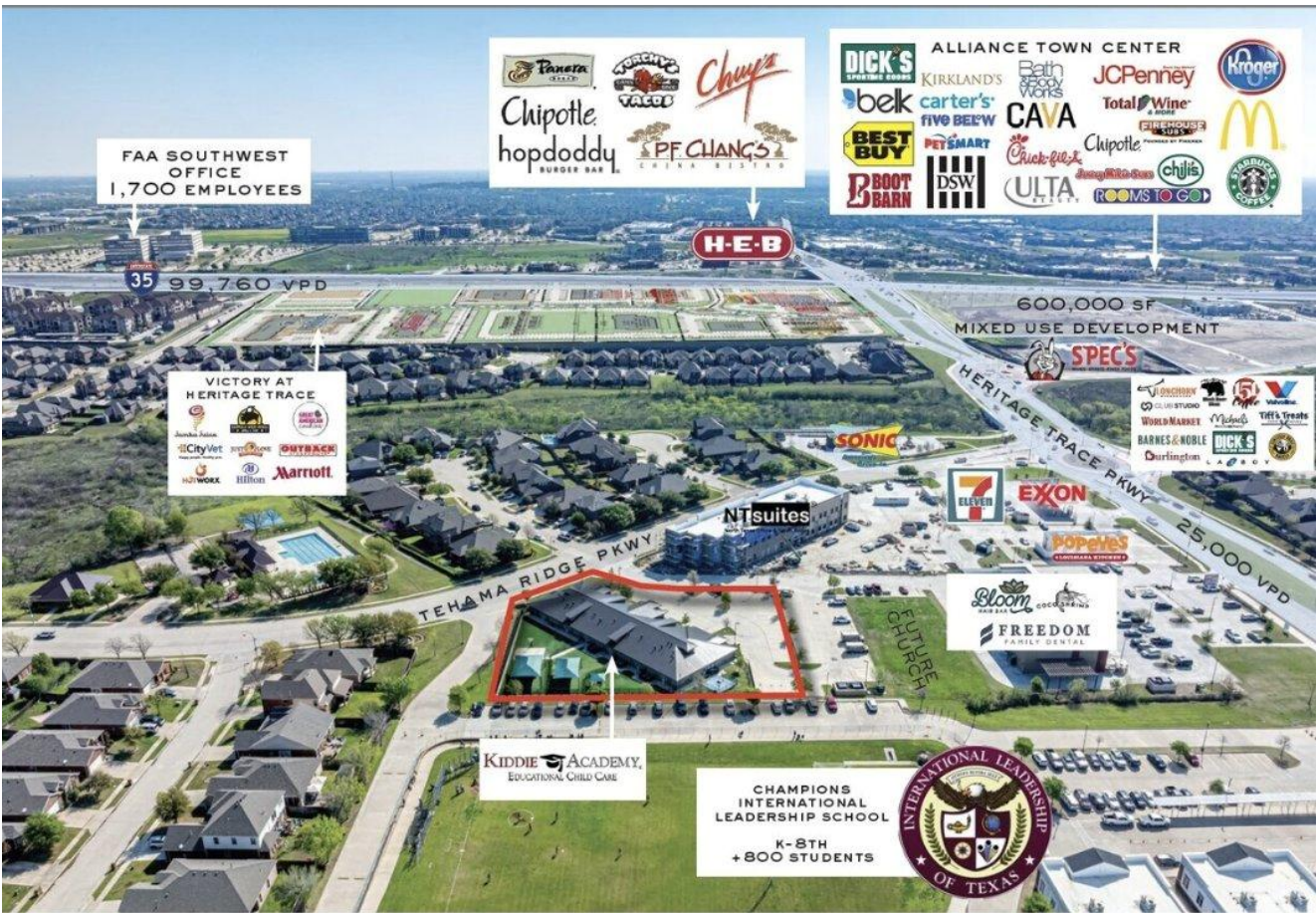
Looking north — Alliance Town Center and Heritage Trace retail nodes (Kroger, JCPenney, Best Buy, Dick's, Total Wine, Chick-fil-A, McDonald's, Starbucks, plus Panera, Chipotle, Hopdoddy, P.F. Chang's, Torchy's, Chuy's). I-35W carries 99,760 VPD; FAA Southwest Office (1,700 employees) and 600,000 SF mixed-use development add daytime population.

The property sits at the intersection of two well-established retail and mixed-use trade areas: