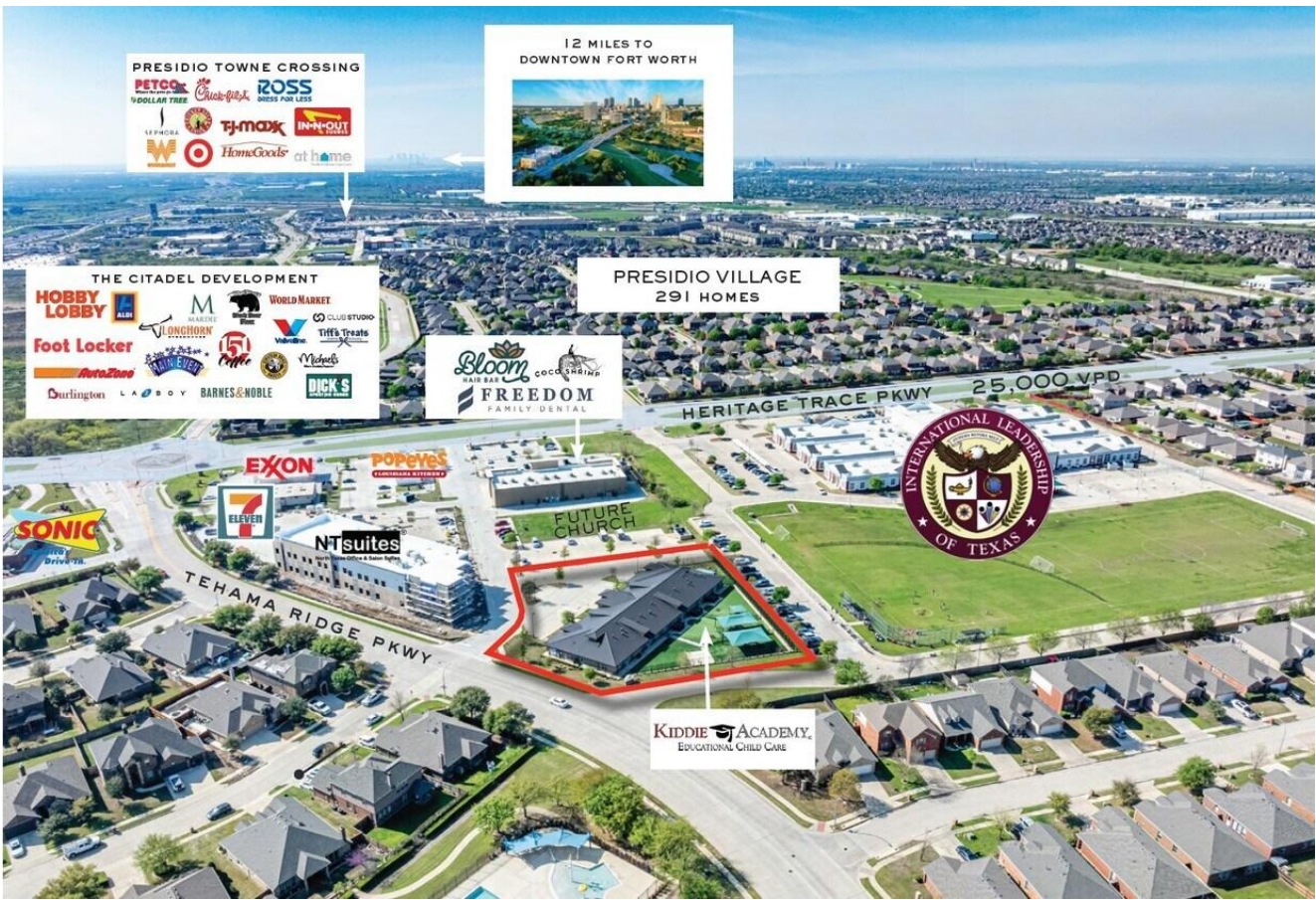
Looking south — Presidio Towne Crossing (Target, HomeGoods, Ross, In-N-Out, Petco) and The Citadel (Hobby Lobby, Aldi, Marshalls, World Market, Burlington, Dick's, Barnes & Noble) anchor the broader trade area. 12 miles to downtown Fort Worth via I-35W; Heritage Trace Pkwy carries 25,000 VPD.