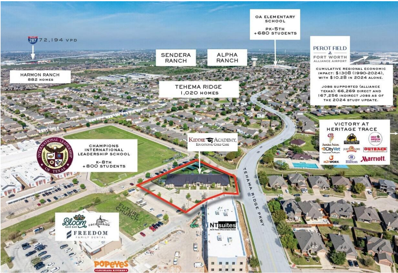
Immediate trade area — surrounded by Tehama Ridge (1,020 homes), Harmon Ranch (882 homes), Sendera Ranch and Alpha Ranch. Adjacent to Champions International Leadership of Texas (K-8, 800+ students), OA Elementary (PK-5, 680+ students), and Victory at Heritage Trace retail / lodging cluster. Perot Field / Fort Worth Alliance Airport is the regional employment anchor.