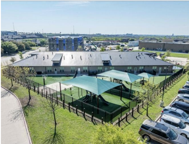
Aerial — playground & shade canopies