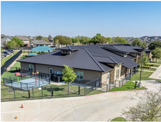
Aerial — splash pad & secured play area