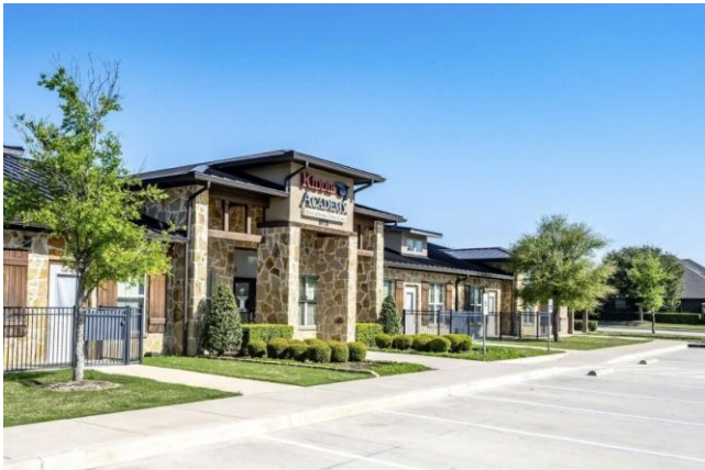
Front entrance — stone & shake architecture