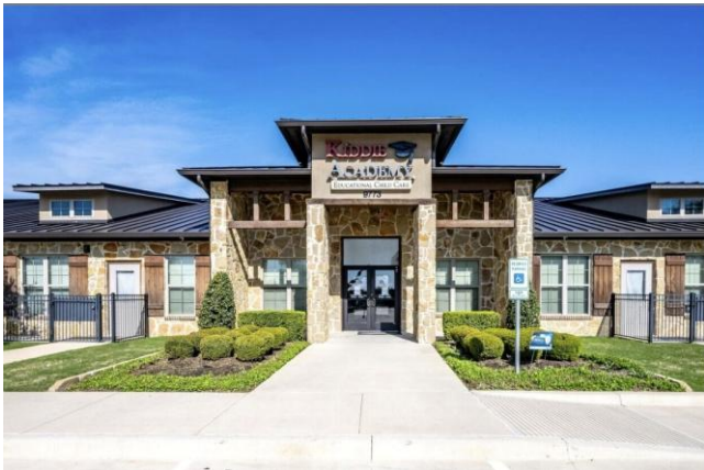
Main entry — covered drop-off