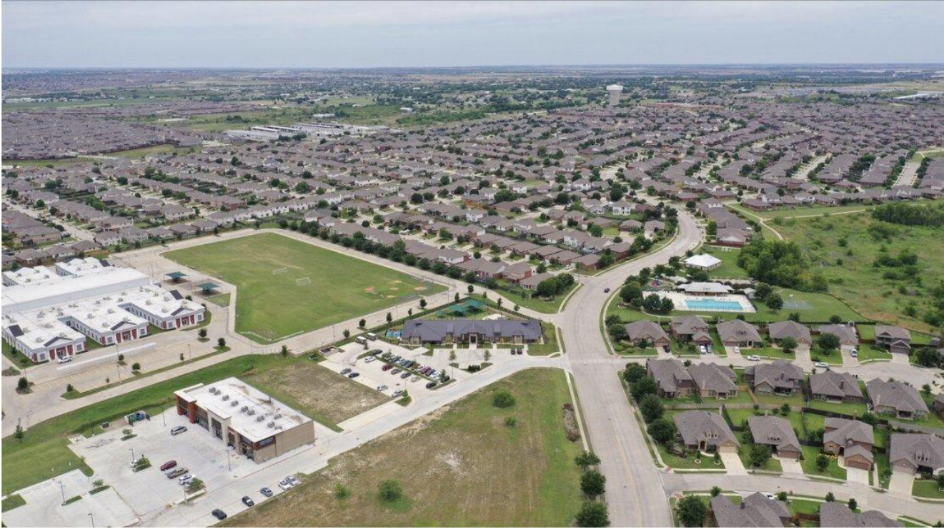
Looking across the immediate trade area — visible residential density and continued single-family development supporting child care demand at the household-formation stage.

Why it matters for child care real estate. Child care is a daily-use service tied to household formation, parent workforce participation and home-to-work commute patterns. The Alliance corridor offers a rare combination of population growth, logistics and office employment density, school concentration and suburban family demographics — a structural underwriting tailwind for a long-duration, single-tenant child care lease.