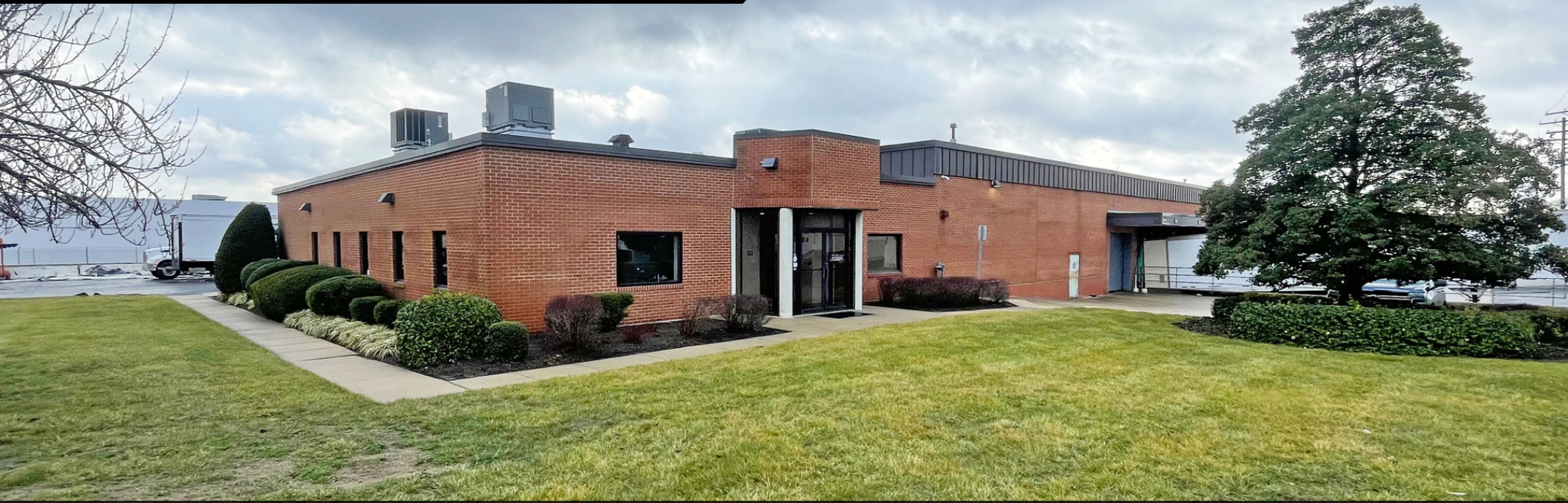
Entrance to office area