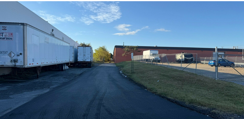
Repaved drive aisle