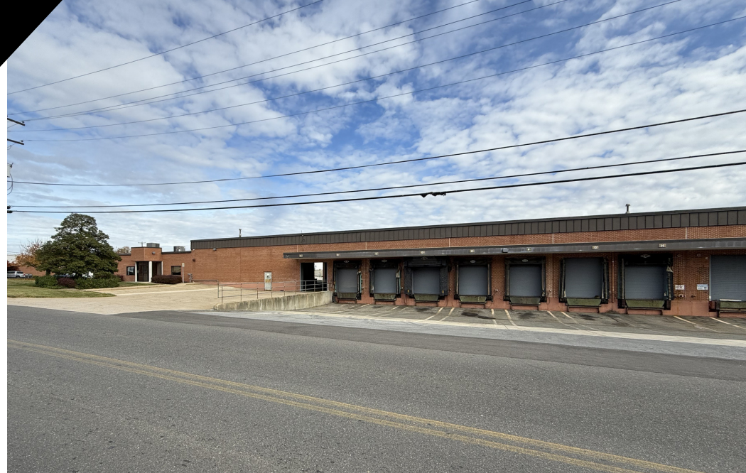
Loading area along Tucker Street