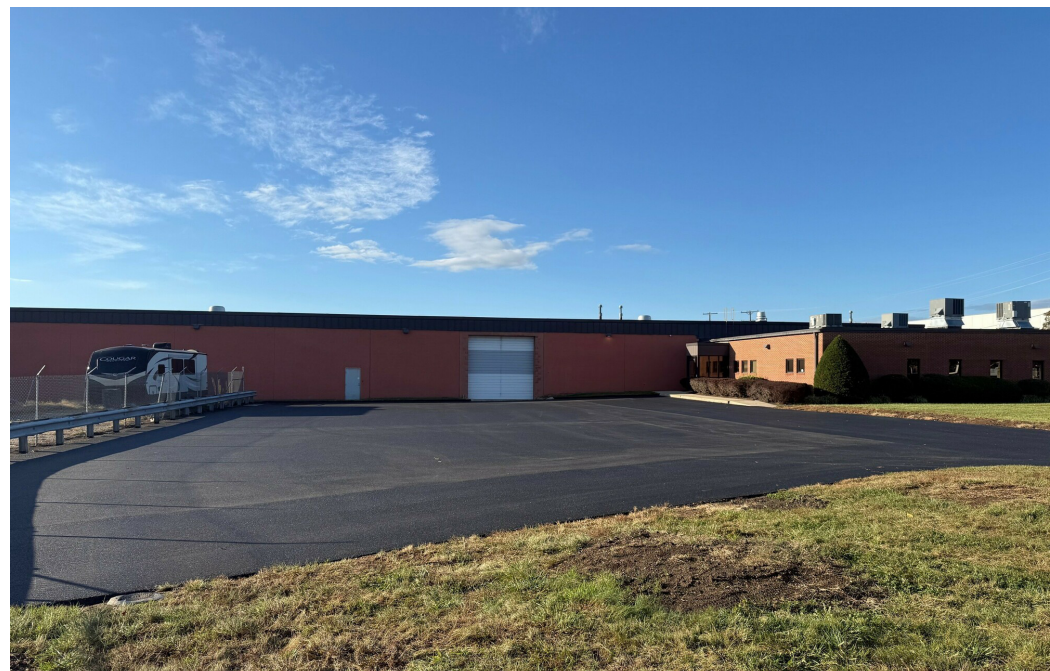
Recently repaved loading with drive-in