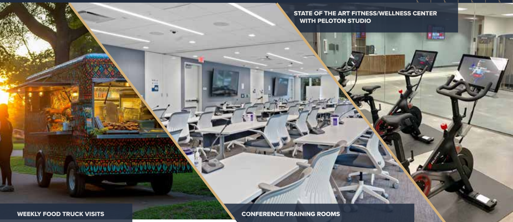
WEEKLY FOOD TRUCK VISITS

Farley White is committed to long term relationships by working with their customers and brokers to make workplace environments that are distinctive and productive. Our management team is engaged from start to finish in every lease transaction.