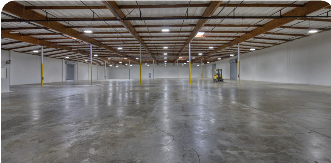
Warehouse Floor — Repoured Slab & New LED Lighting