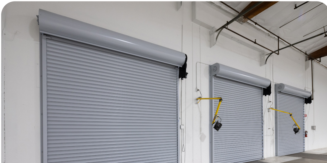
5 Brand New Dock-High Doors — Fully Equipped with Lights & Levelers